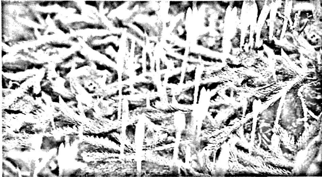
Running Club Moss (highly flammable) Borealforest.org