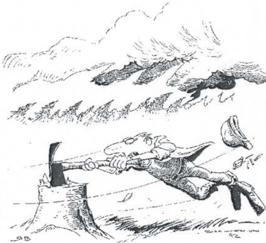
15. WIND INCREASES AND/OR CHANGES DIRECTION

Trigger Points: Today when you're in the field, be sure to establish trigger points for reposition to secure areas in response to high winds. Consider that trees may have been weakened from the fire. Look up at the surrounding area when you park your vehicle to be sure you're not in danger of being hit by falling trees or debris.