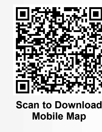
Scan to Download Mobile Map