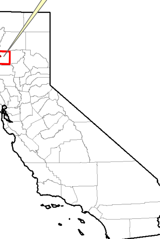
South Fire Location