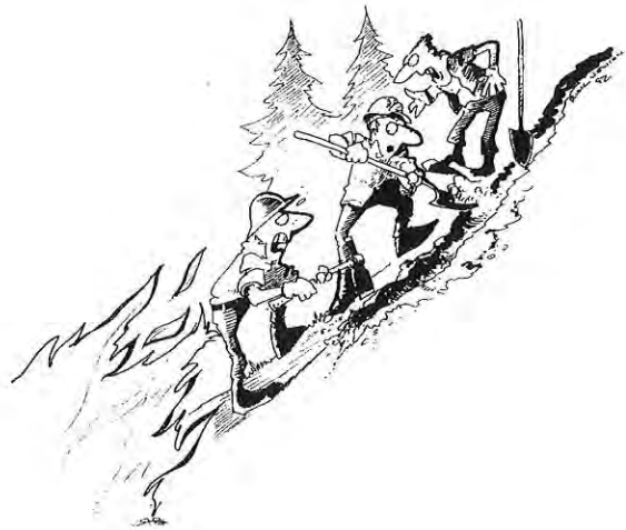
9. BUILDING FIRELINE DOWNHILL WITH FIRE BELOW

Do not think because an accident hasn't happened to you that it can't happen. - ~Safety saying circa early 1900