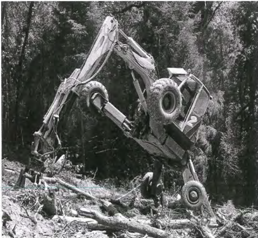
The Spider- A cool tool

Have you evaluated the hazards that are around? Have you thought about the consequences if something goes wrong? Is the risk you and your personnel are taking – worth the benefit? Have you mitigated potential hazards? Scouted your work site(s)? Have you as a supervisor asked for and gotten feedback from your crew? Is someone checking the weather periodically?