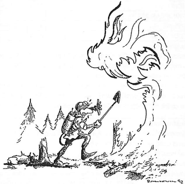
10. ATTEMPTING FRONTAL ASSAULT ON FIRE