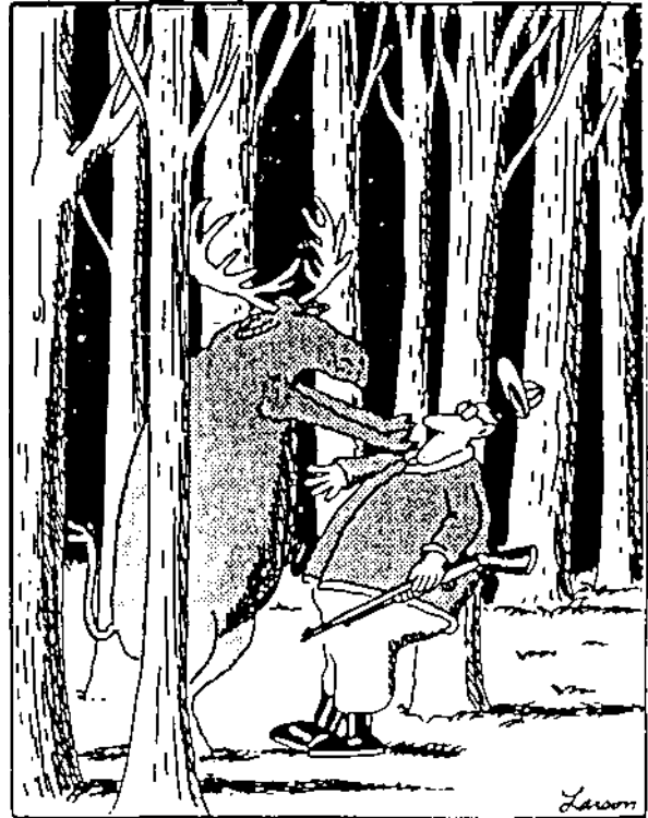
Carl shoves Roger, Roger shoves Carl, and tempers rise

Be aware of these watch out situations and make the effort to recognize and deal with them before they become conflicts that are painful and out of control.