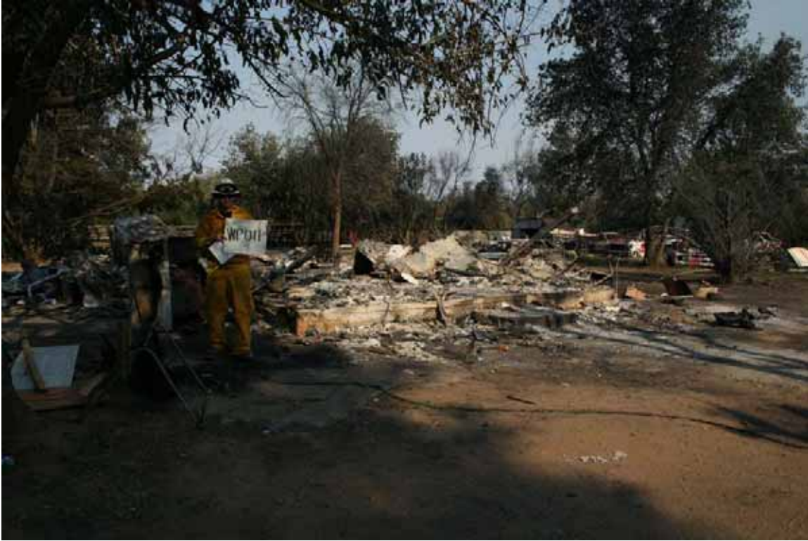
Waypoint 011, 1827 Palermo Rd 6/12/08