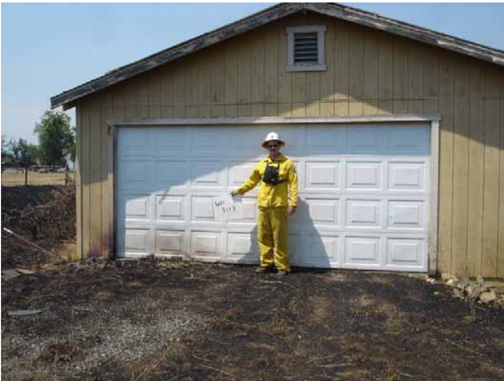
Waypoint 309, 57 Kenneth Ln 6/12/08