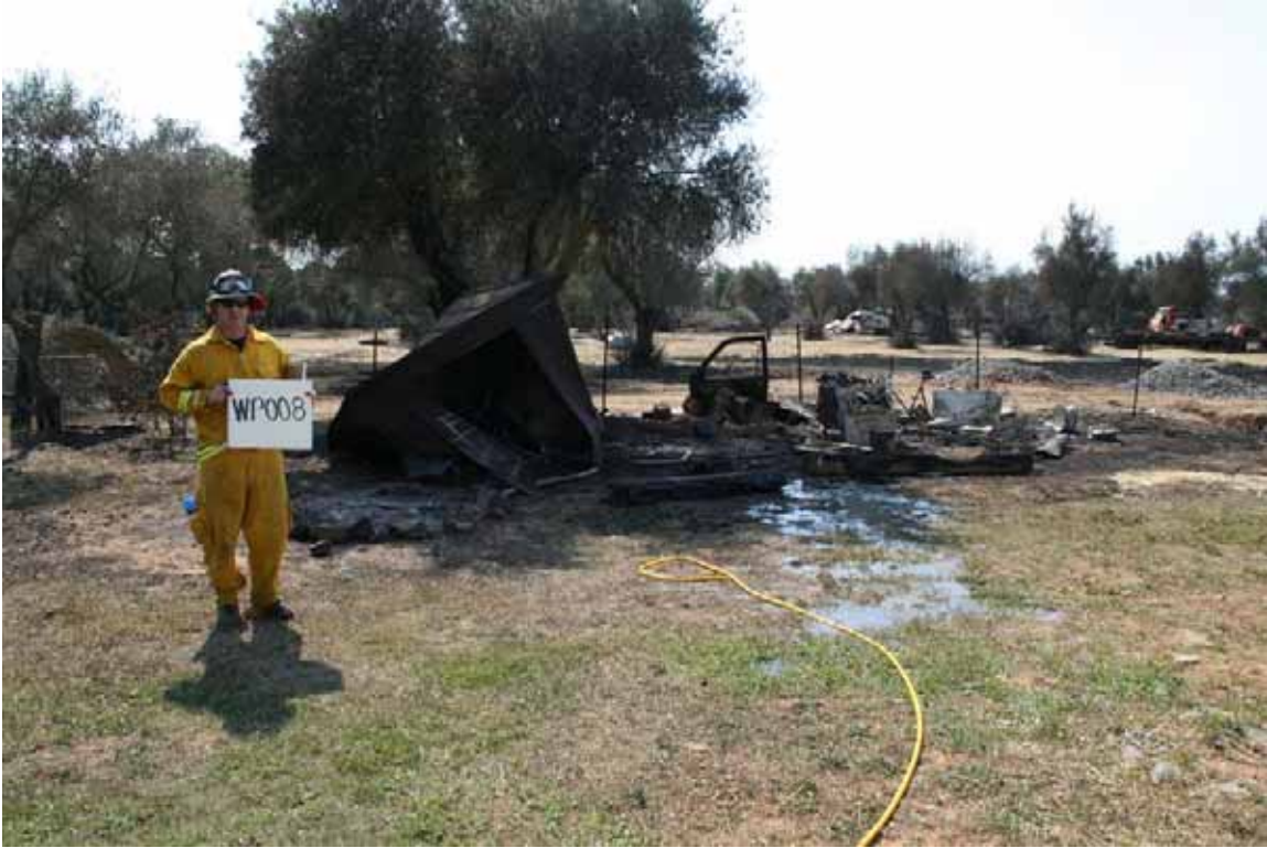
Waypoint 008, 7111 Occidental Ave 6/12/08