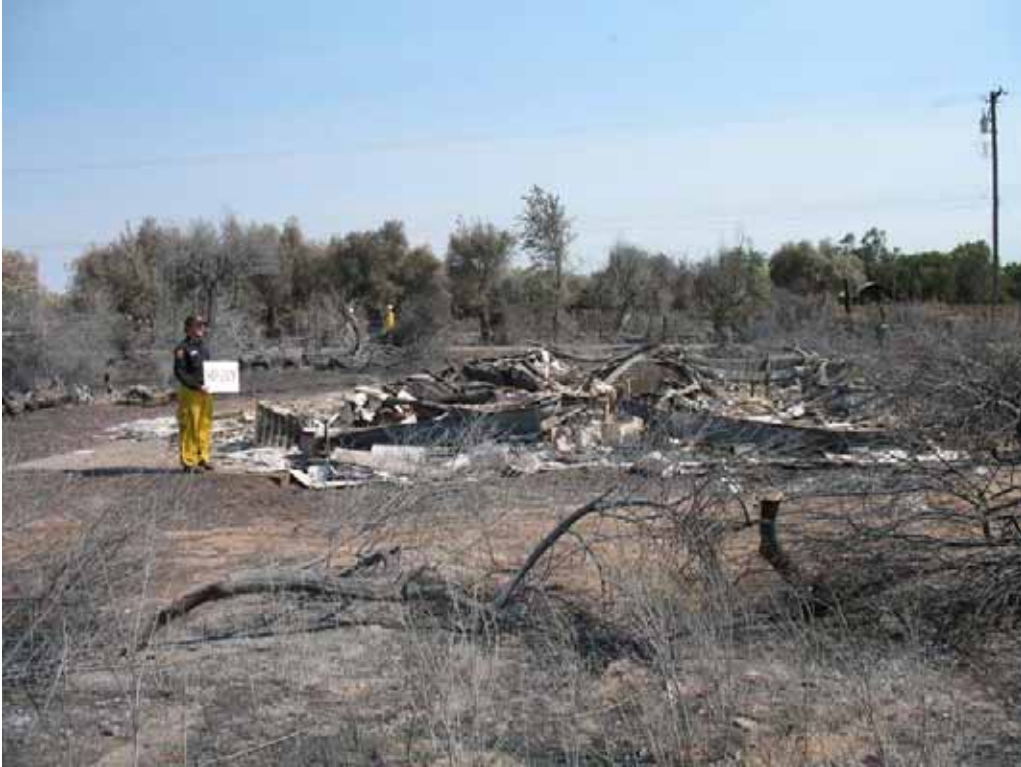
Waypoint 209, 1760 North Villa Ave 6/12/08