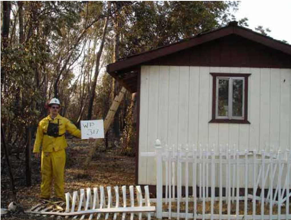
Waypoint 316, 8033 Melvina Ave 6/12/08