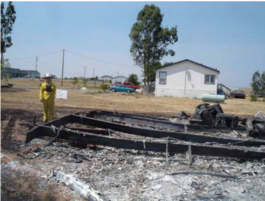
Waypoint 311, 60 Geary Ct 6/12/08