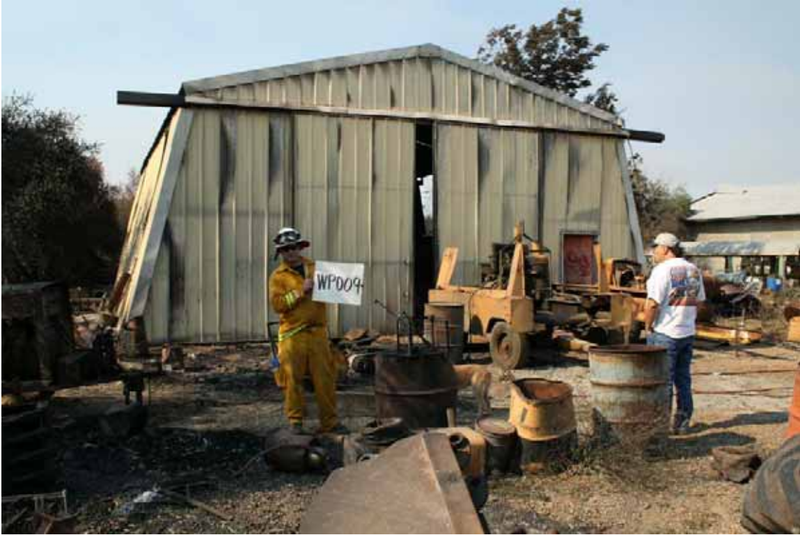
Waypoint 009, 1784 Palermo Rd 6/12/08