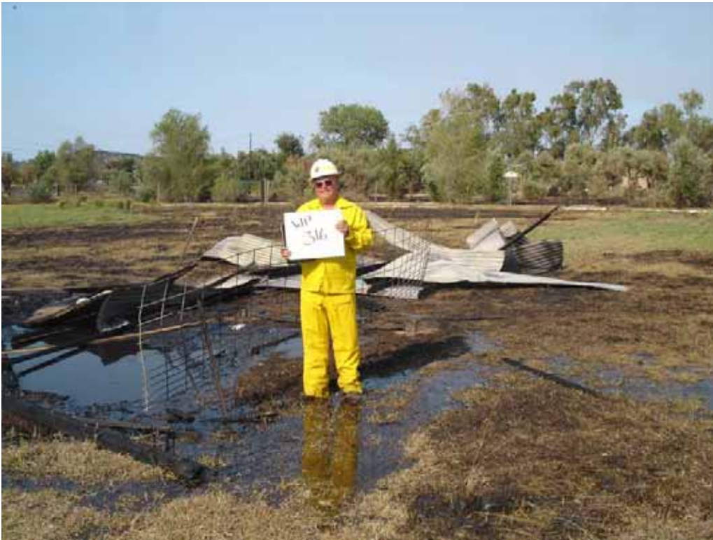
Waypoint 316, 8033 Melvina Ave 6/12/08