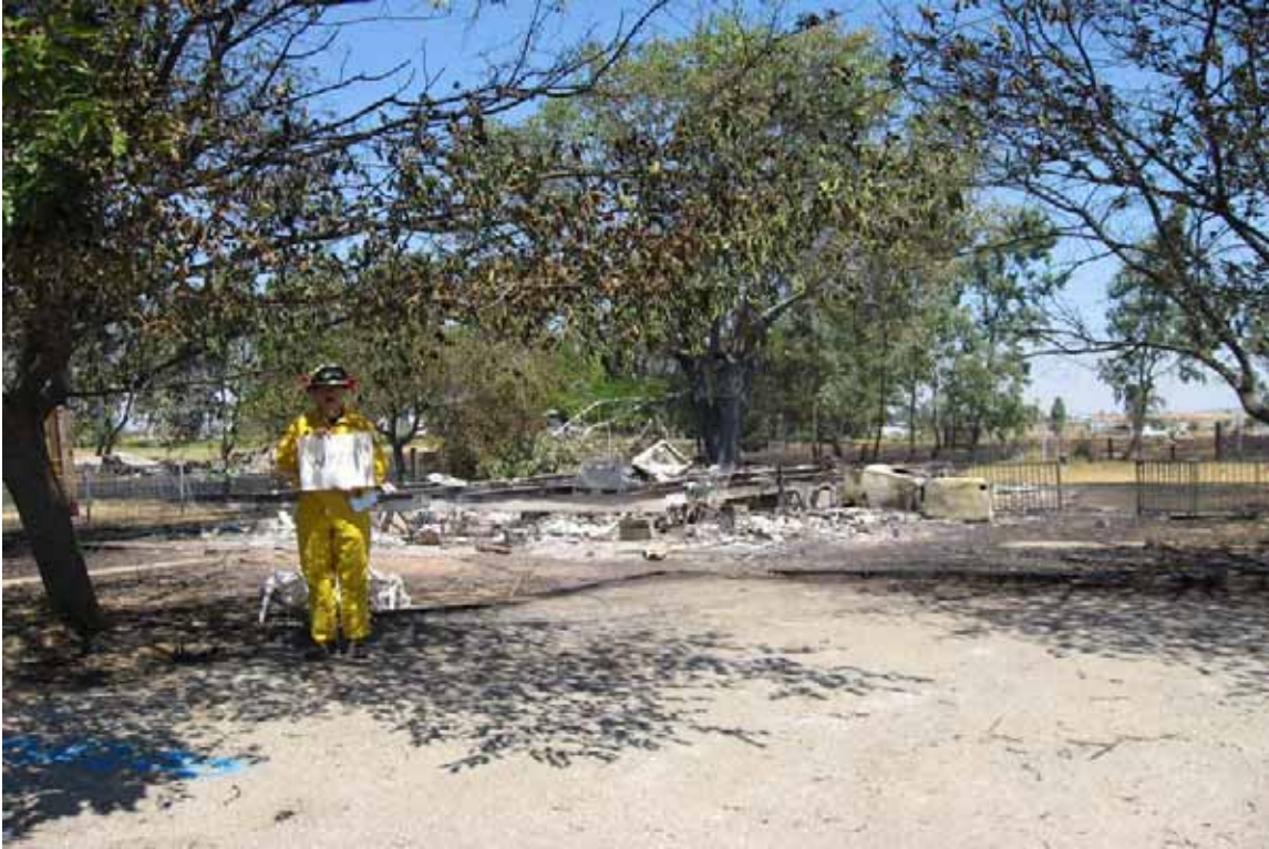
Waypoint 200, 111 Prince Rd 6/12/08