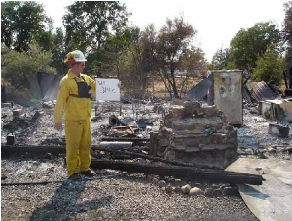
Waypoint 314-C, 2540 Palermo-Honcut Hiway 6/12/08