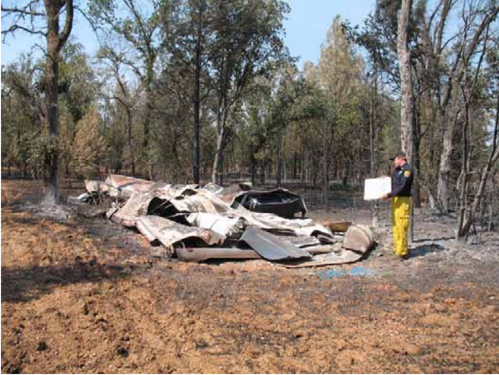
Waypoint 208, 7095 Occidental Ave 6/12/08