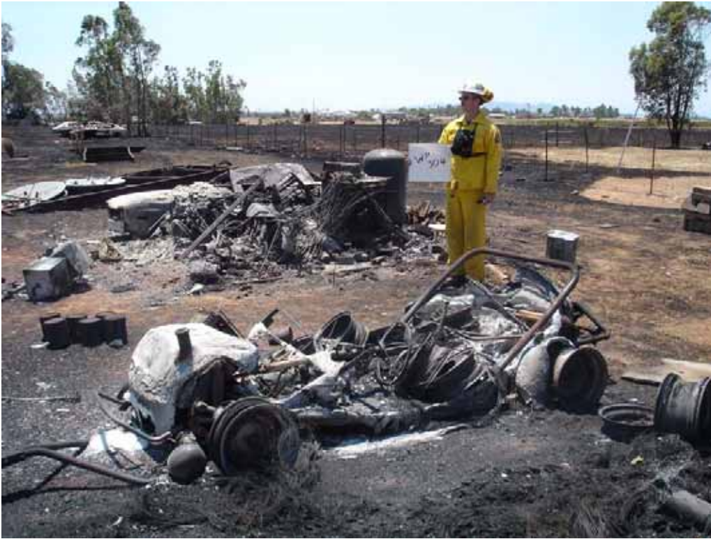
Waypoint 304, 63 Peachy Kean Way 6/12/08