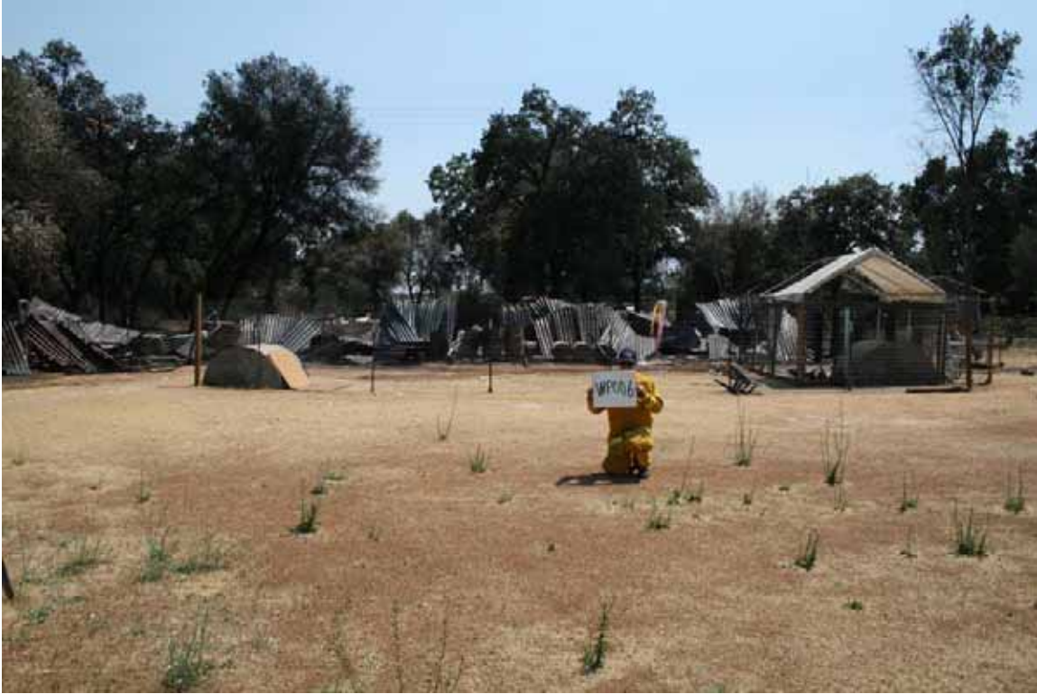
Waypoint 006, 2055 Williams Ave 6/12/08