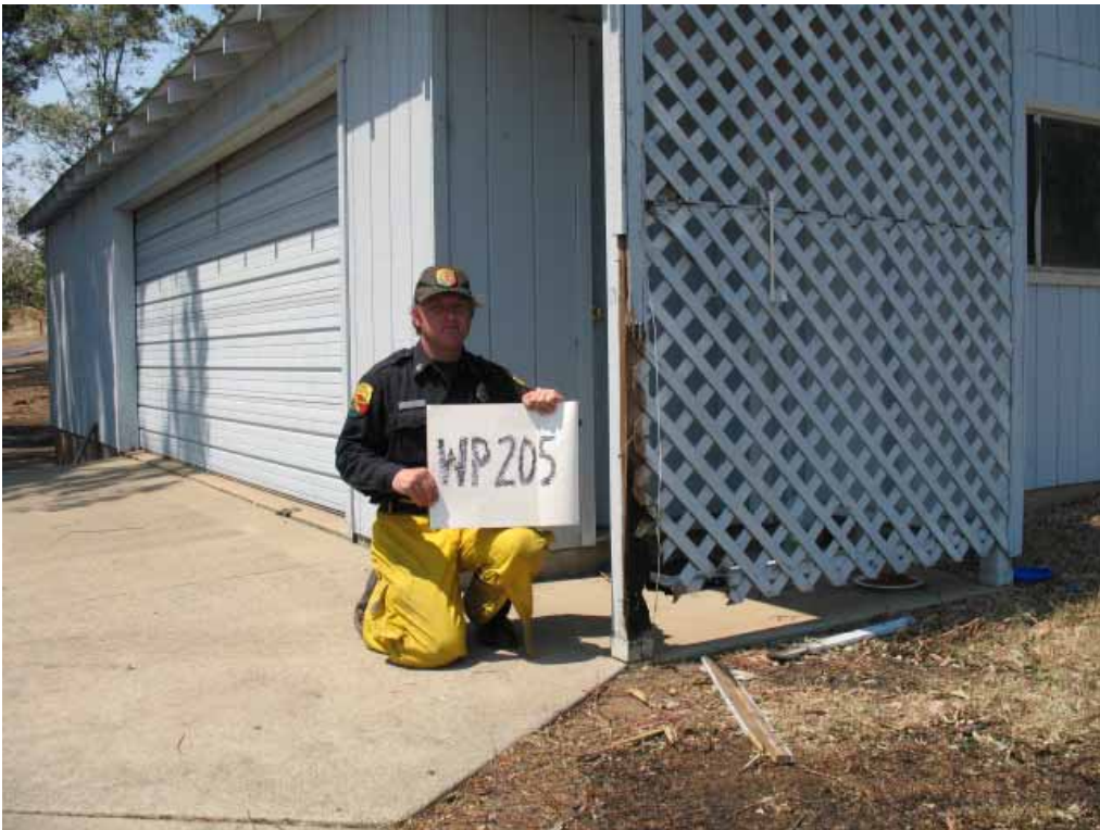
Waypoint 205, Theresa Lane 6/12/08