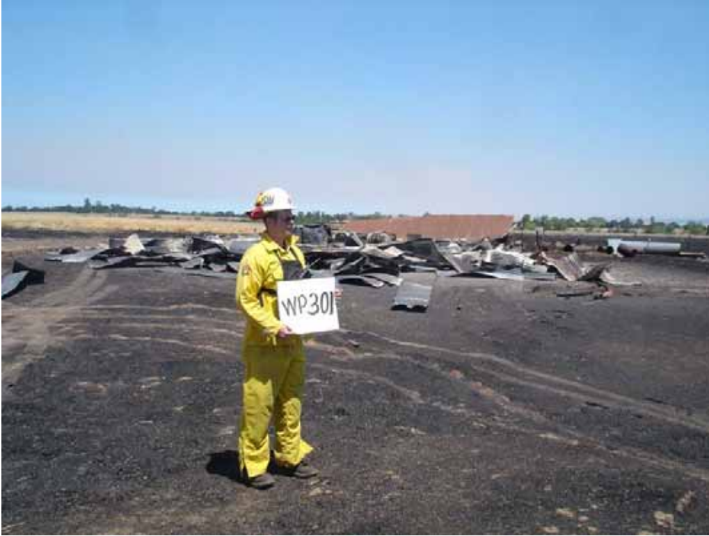
Waypoint 301, 5112 Powerhouse Hill Rd 6/12/08