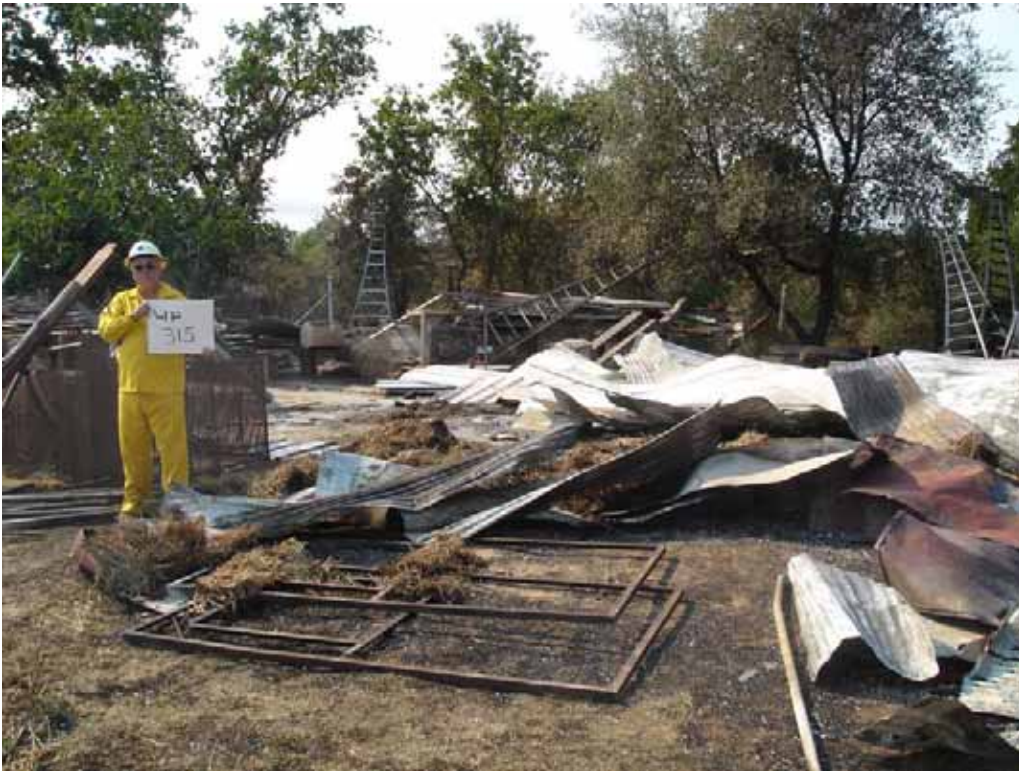
Waypoint 315, 2420 Louis Ave 6/12/08