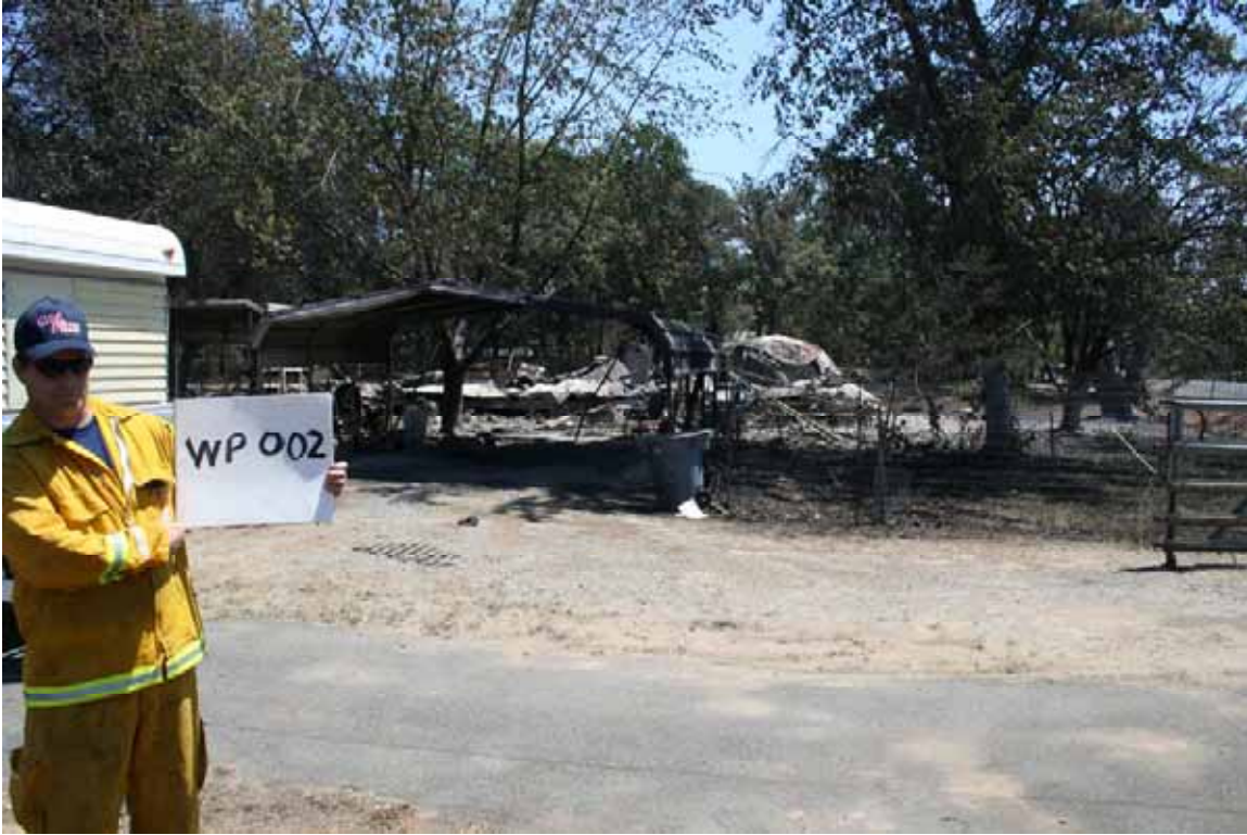
Waypoint 002, 2080 South Villa Ave 6/12/08