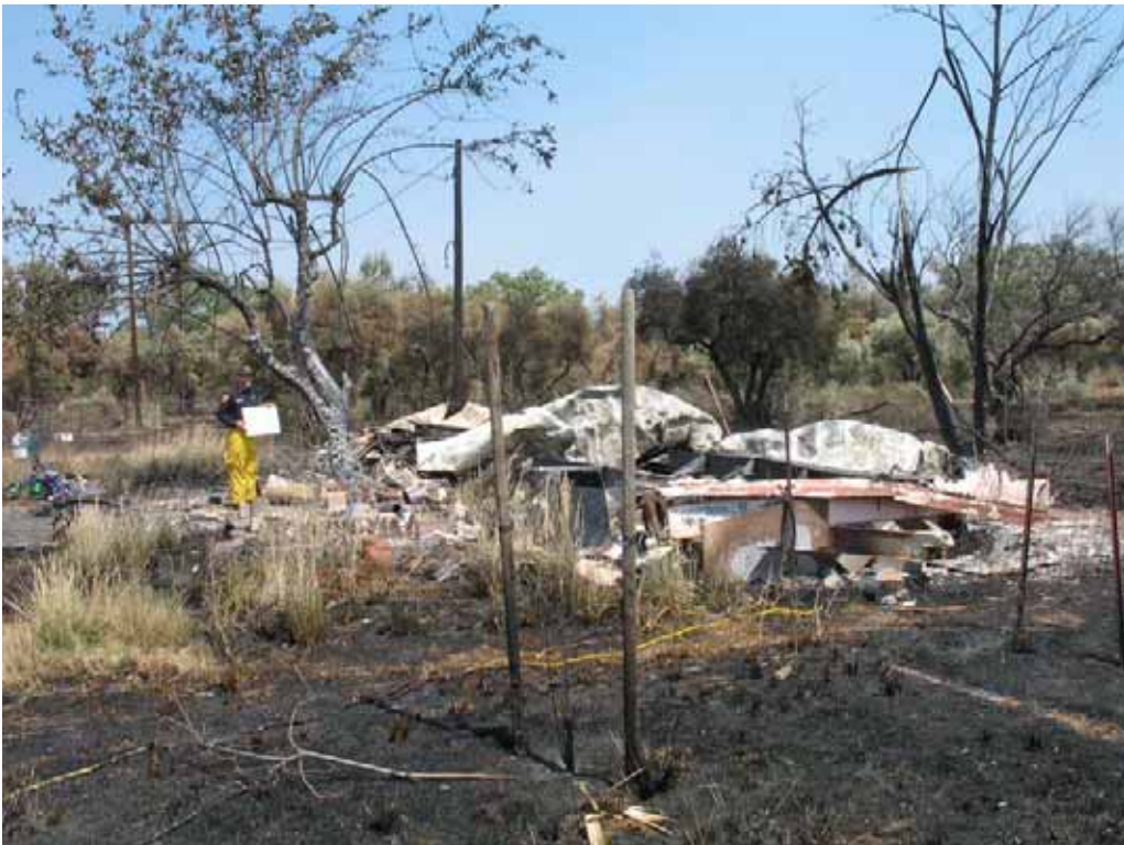
Waypoint 206, 7024 Occidental Ave 6/12/08