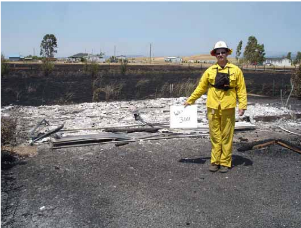
Waypoint 310, 65 Kenneth Ln 6/12/08