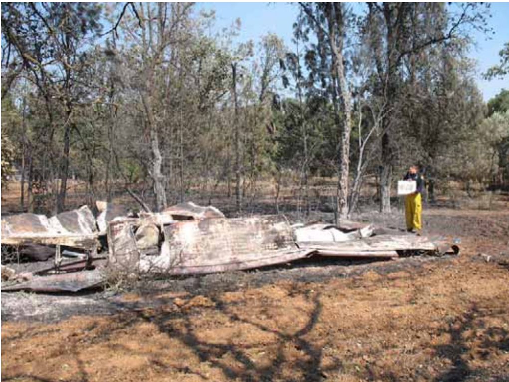
Waypoint 208, 7095 Occidental Ave 6/12/08