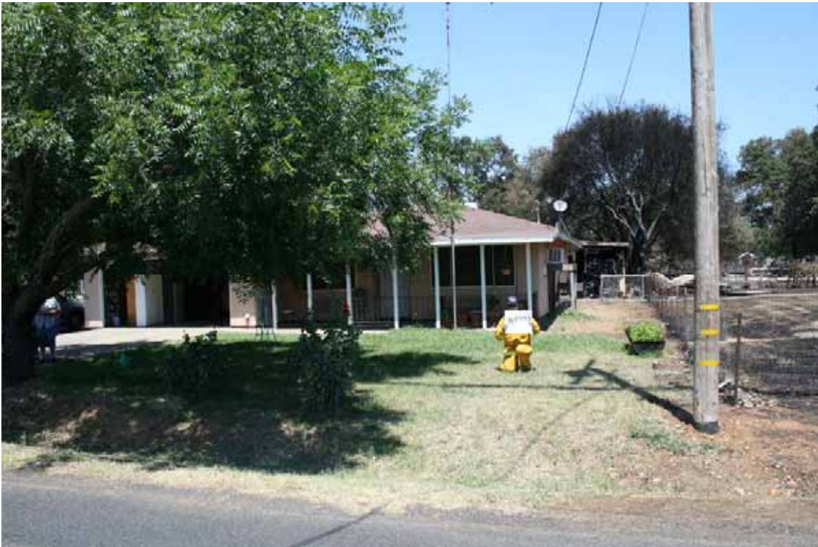
Waypoint 003, 2060 South Villa Ave 6/12/08