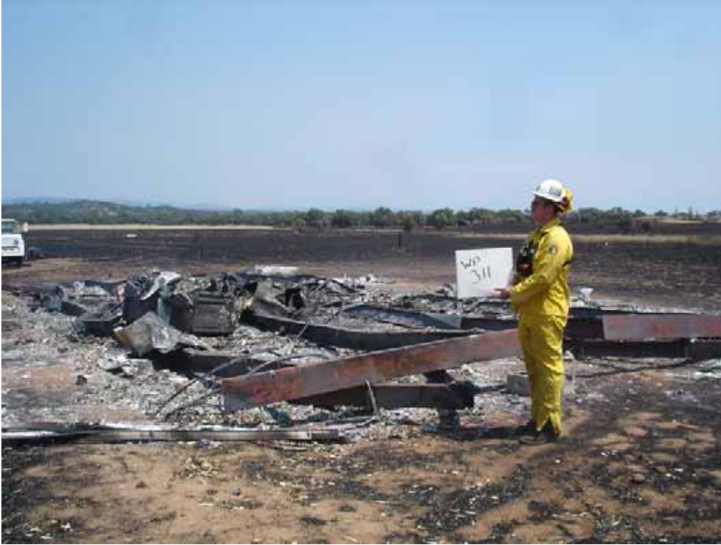
Waypoint 311, 60 Geary Ct 6/12/08