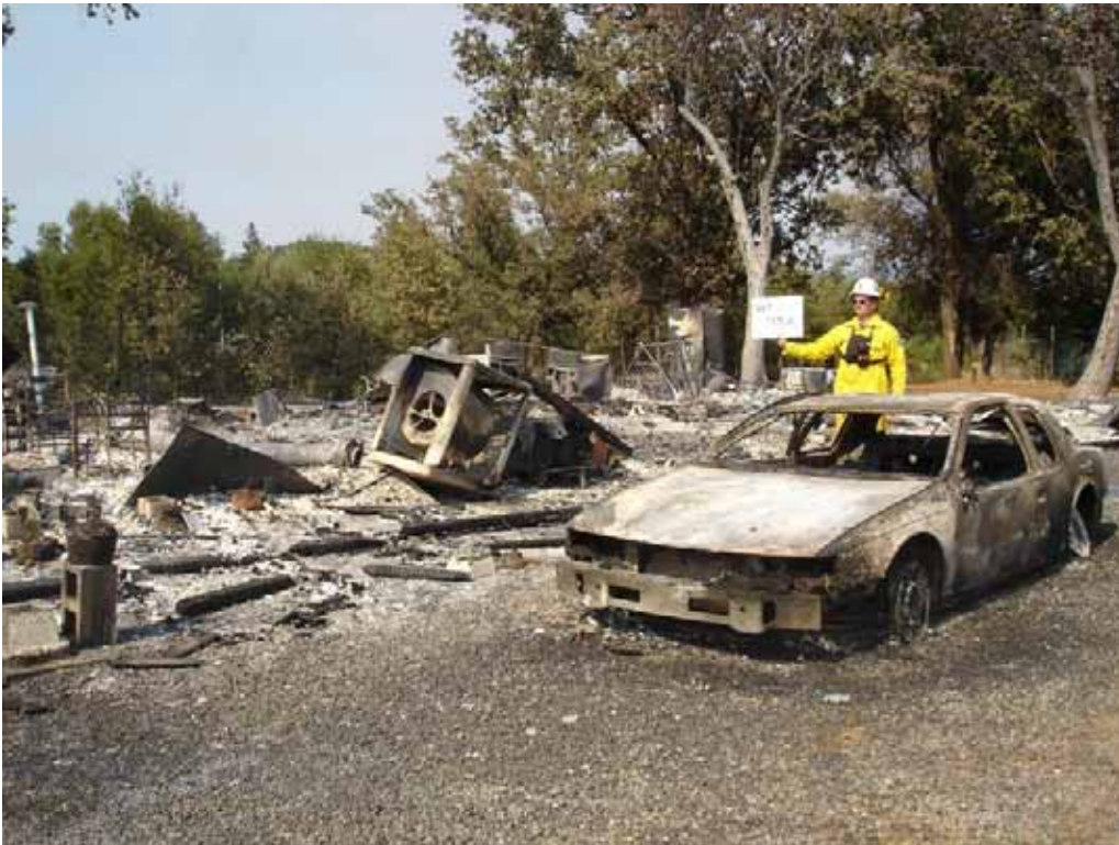
Waypoint 314-A, 2540 Palermo-Honcut Hiway 6/12/08