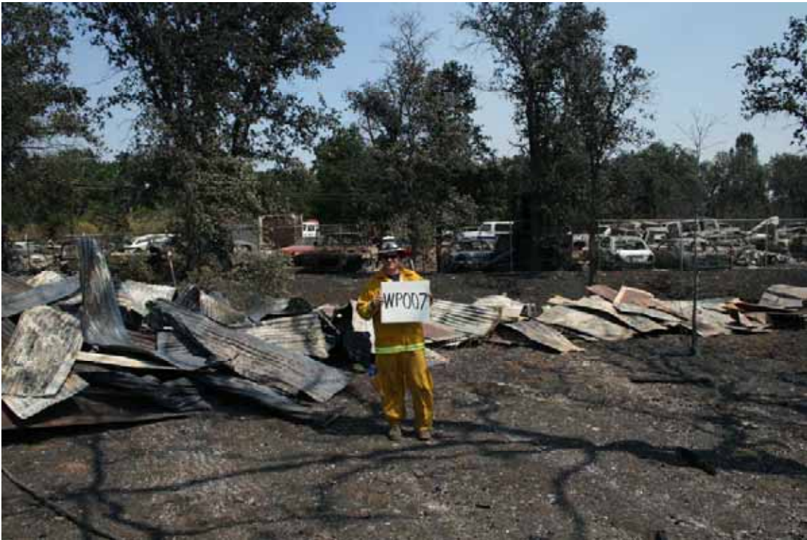
Waypoint 007, 1921 Williams Ave 6/12/08