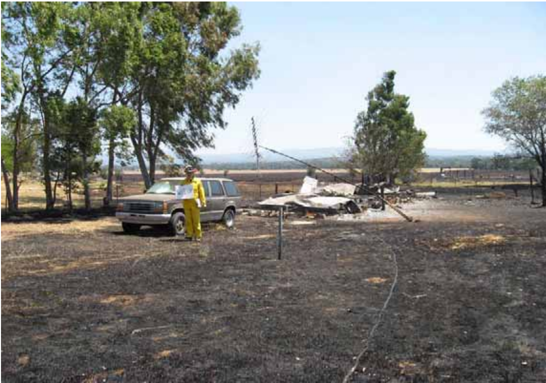
Waypoint 201, 62 Horney Toad Rd 6/12/08