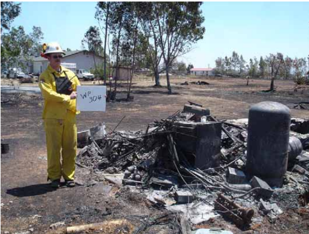
Waypoint 304, 63 Peachy Kean Way 6/12/08