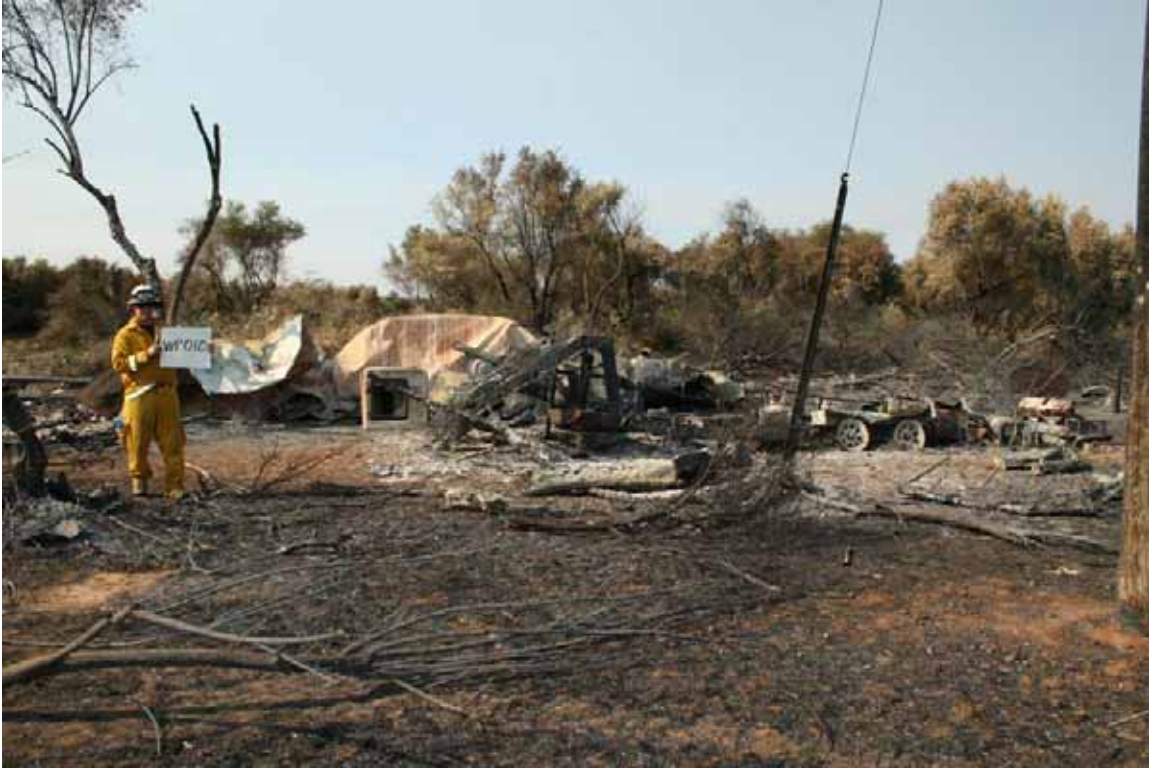
Waypoint 010, 1780 Palermo Rd 6/12/08