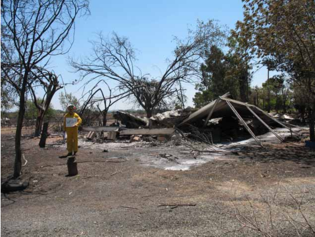
Waypoint 204, 88 Horney Toad Rd 6/12/08