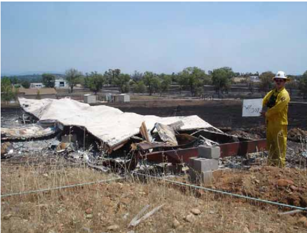
Waypoint 307, 546 Justelle Drive 6/12/08