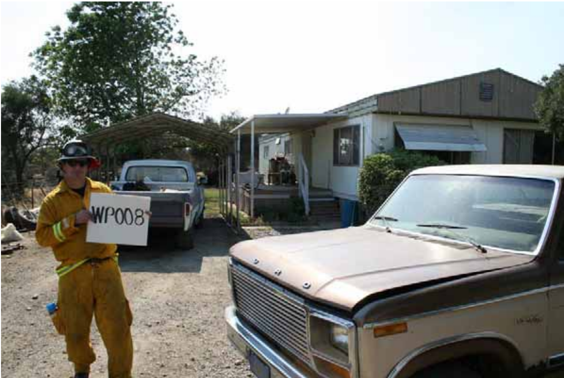
Waypoint 008, 7111 Occidental Ave 6/12/08