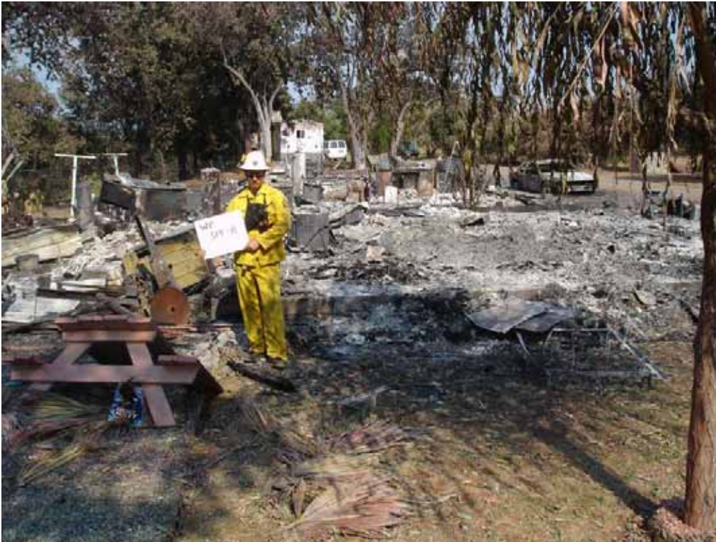
Waypoint 314-B, 2540 Palermo-Honcut Hiway 6/12/08