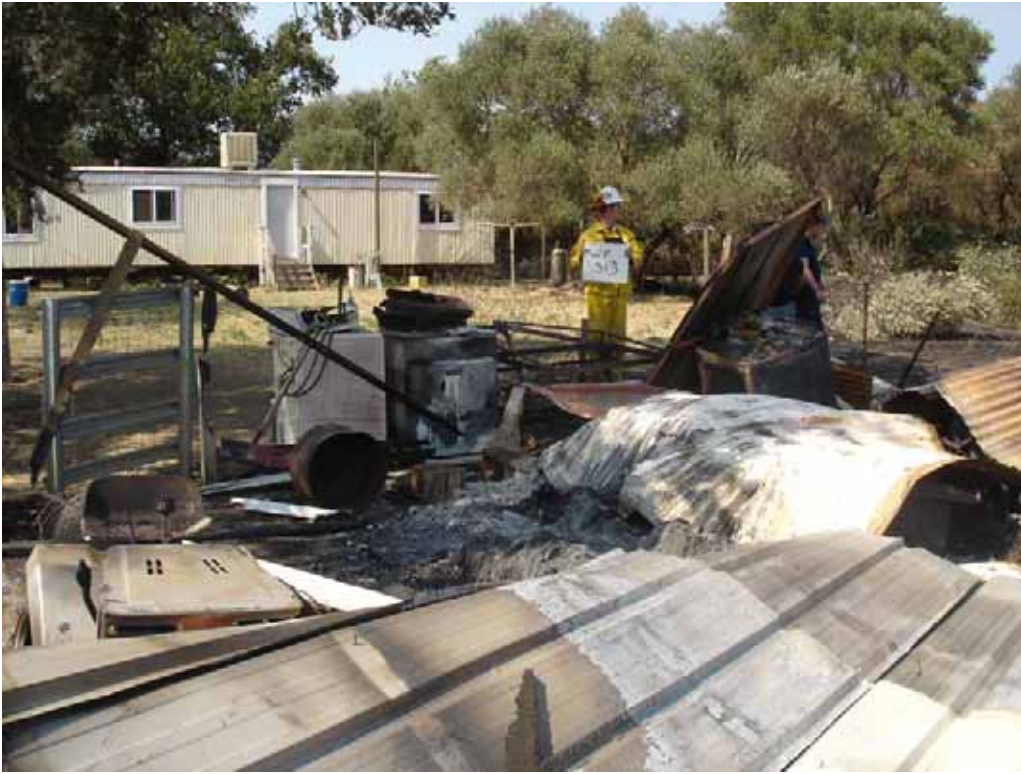
Waypoint 313, 7875 Irwin Ave 6/12/08