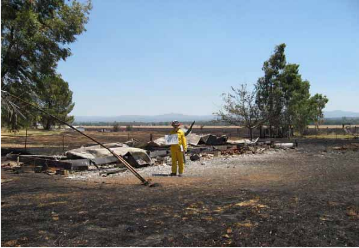
Waypoint 201, 62 Horney Toad Rd 6/12/08