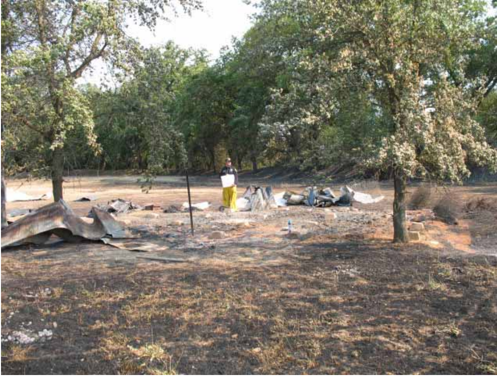
Waypoint 210, 1737 Palermo Rd 6/12/08