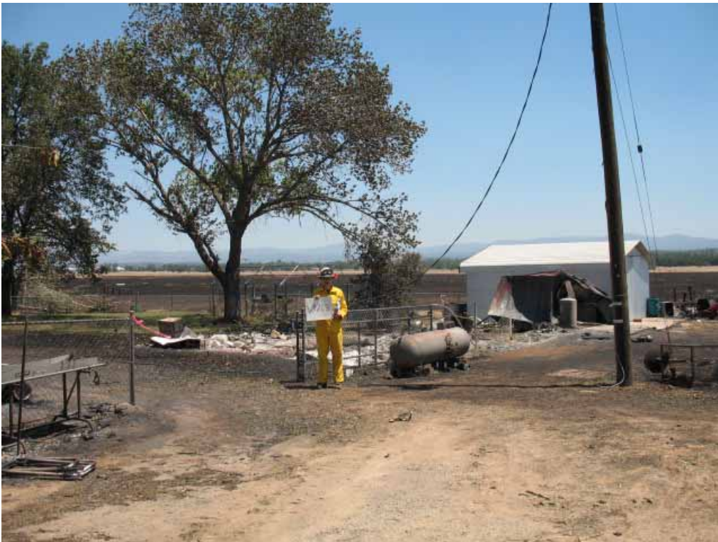
Waypoint 203, 29 Mur-Mel Rd 6/12/08