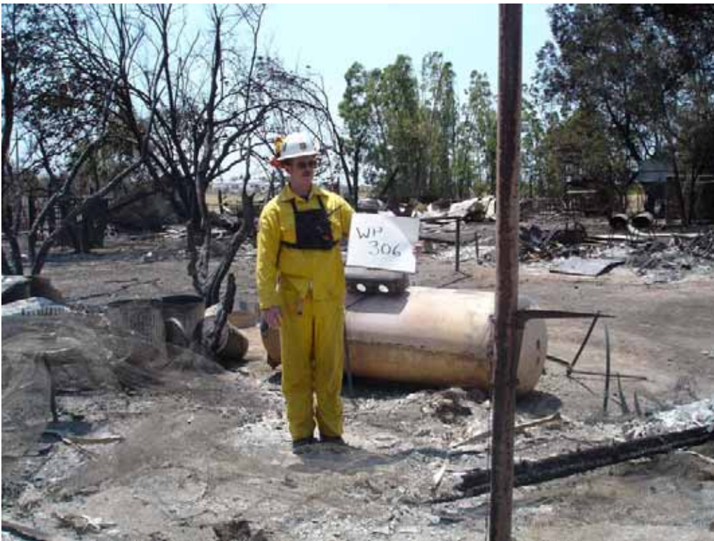
Waypoint 306, 378 Lone Tree Rd 6/12/08