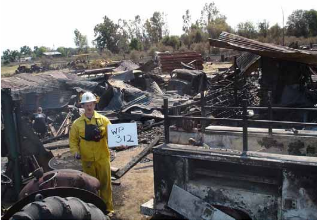
Waypoint 312, 7874 Irwin Ave 6/12/08