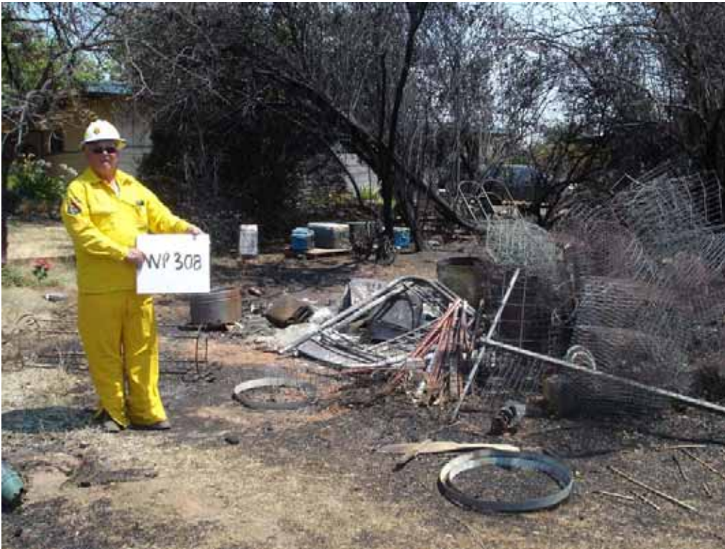
Waypoint 308, 467 Lone Tree Rd 6/12/08