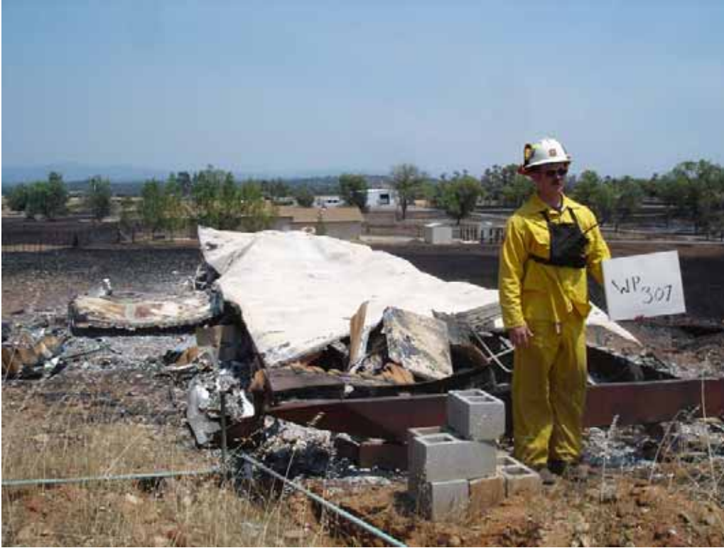
Waypoint 307, 546 Justelle Drive 6/12/08