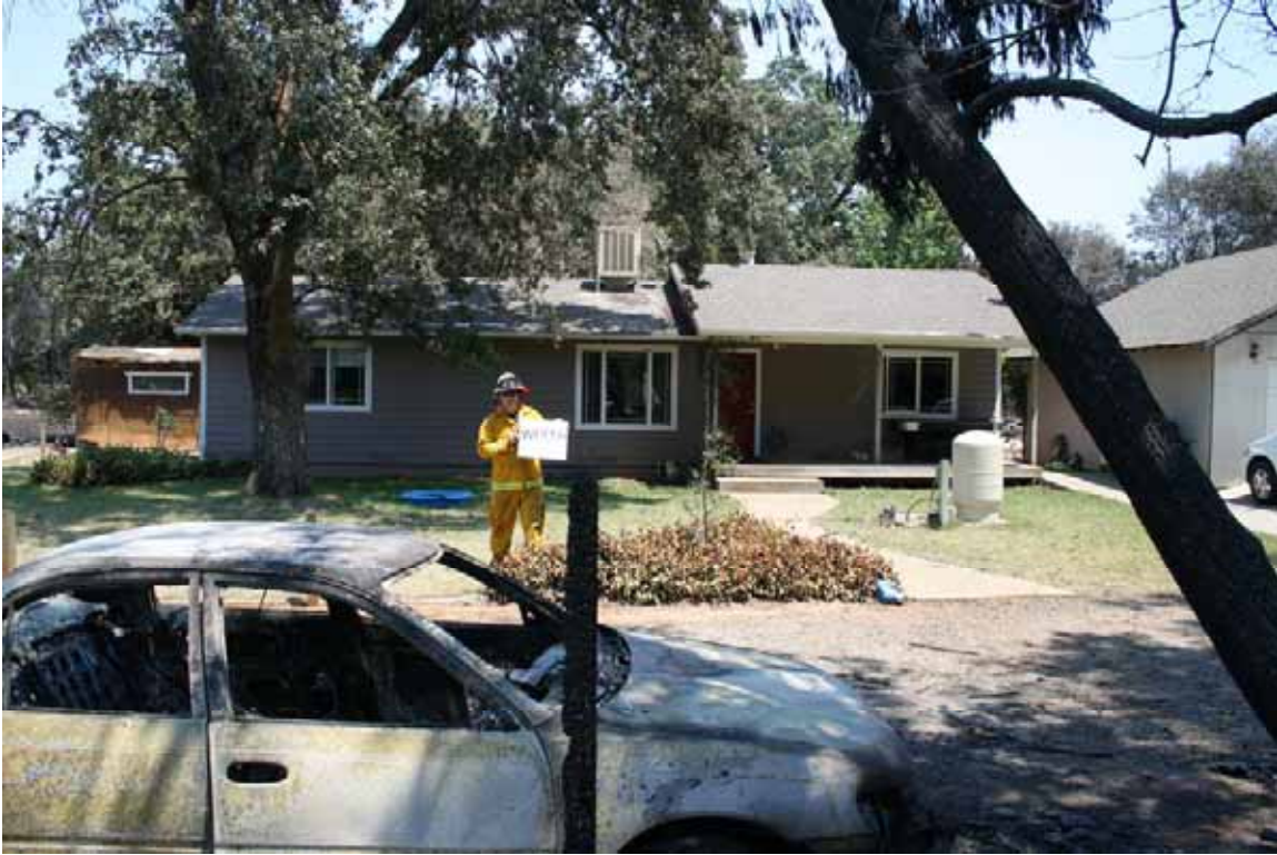
Waypoint 003, 2060 South Villa Ave 6/12/08