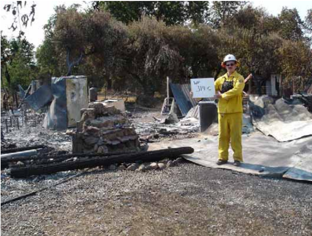
Waypoint 314-C, 2540 Palermo-Honcut Hiway 6/12/08