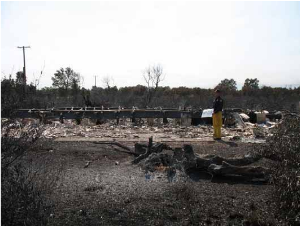
Waypoint 209, 1760 North Villa Ave 6/12/08