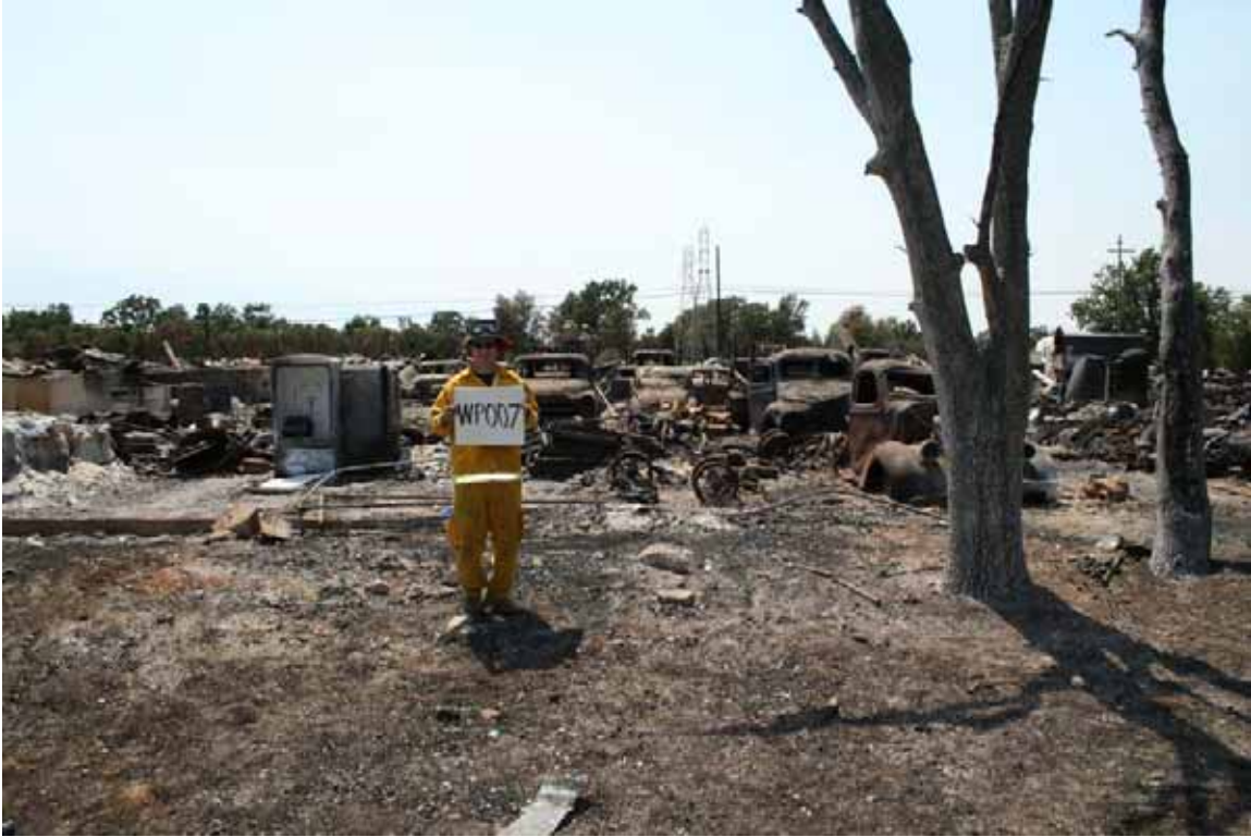
Waypoint 007, 1921 Williams Ave 6/12/08