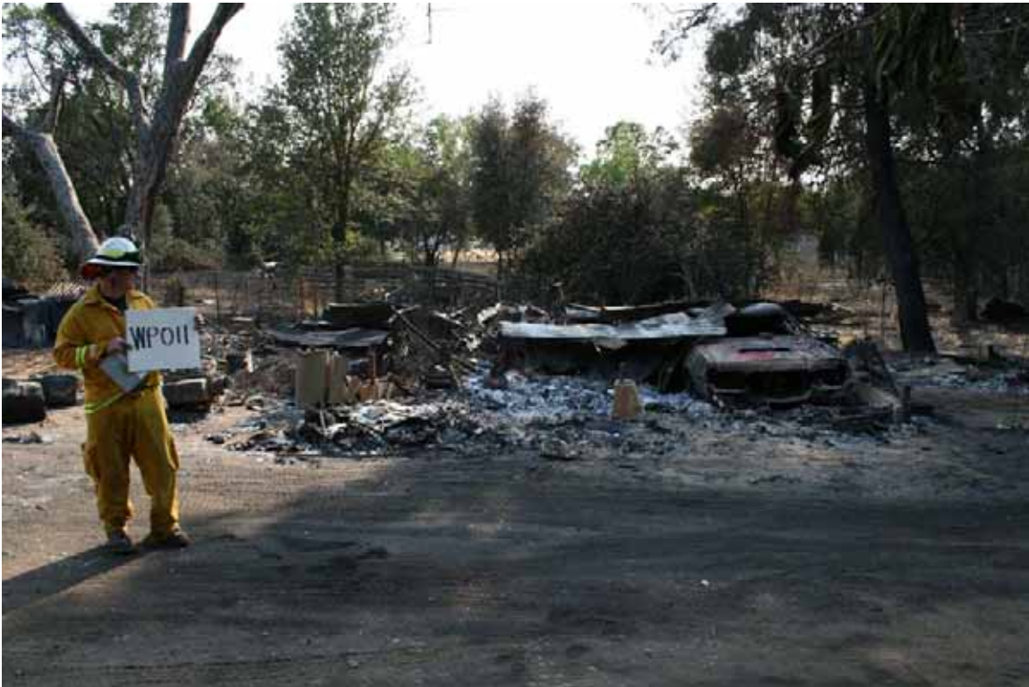
Waypoint 011, 1827 Palermo Rd 6/12/08