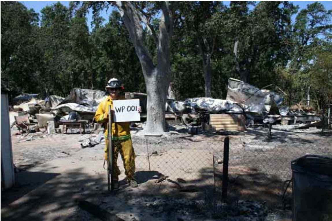
Waypoint 001, 1981 South Villa Ave 6/12/08