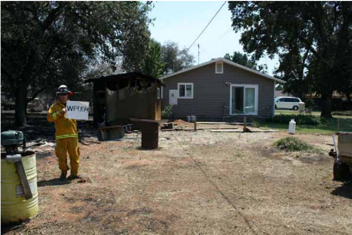
Waypoint 003, 2060 South Villa Ave 6/12/08