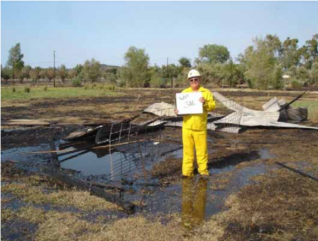
Waypoint 316, 8033 Melvina Ave 6/12/08