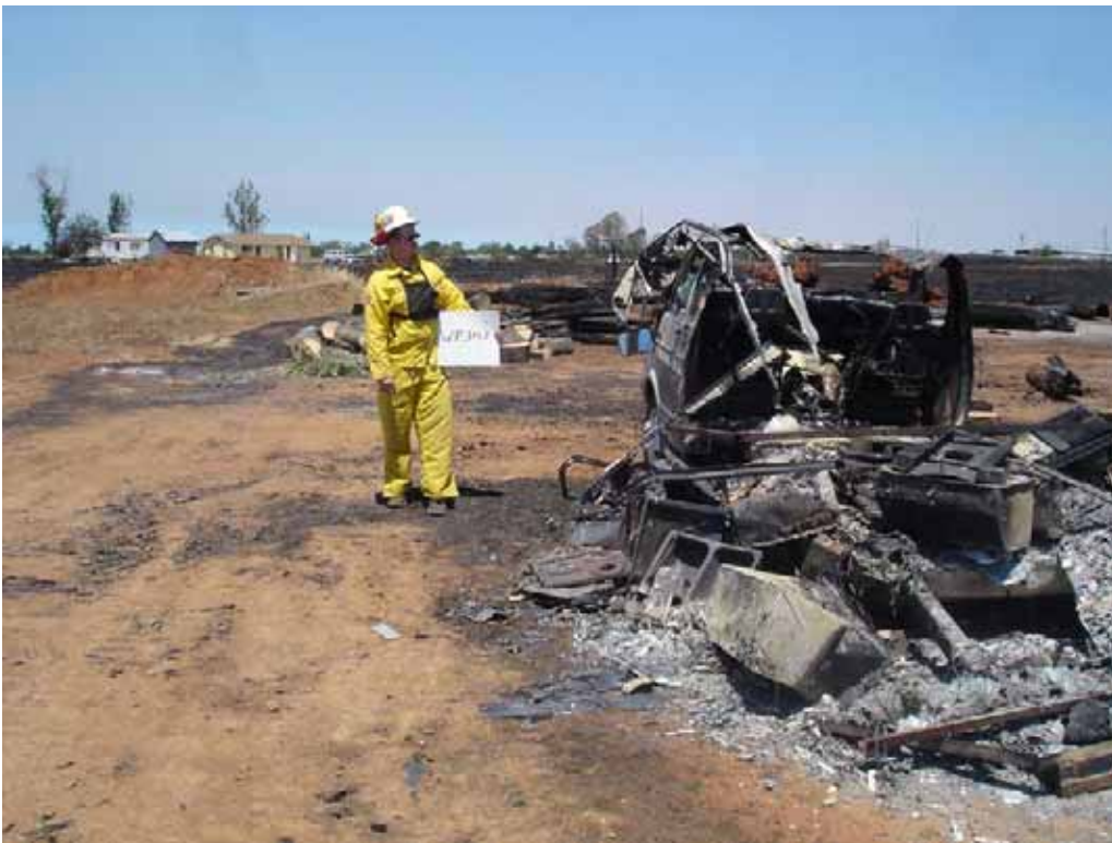
Waypoint 303, 5433 Powerhouse Hill Rd 6/12/08