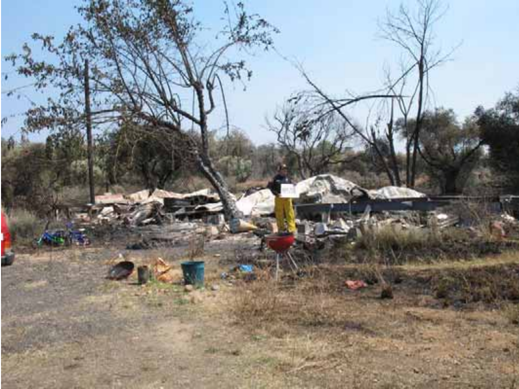
Waypoint 206, 7024 Occidental Ave 6/12/08