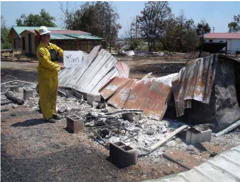
Waypoint 305, 354 Lone Tree Rd 6/12/08