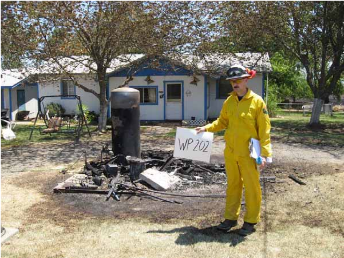
Waypoint 201, 62 Horney Toad Rd 6/12/08