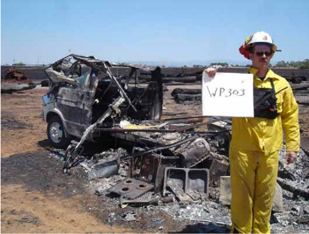
Waypoint 303, 5433 Powerhouse Hill Rd 6/12/08