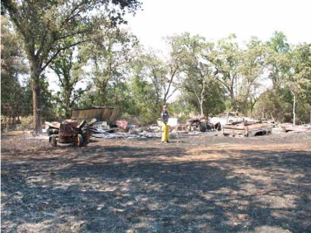
Waypoint 207, 7025 Occidental Ave 6/12/08