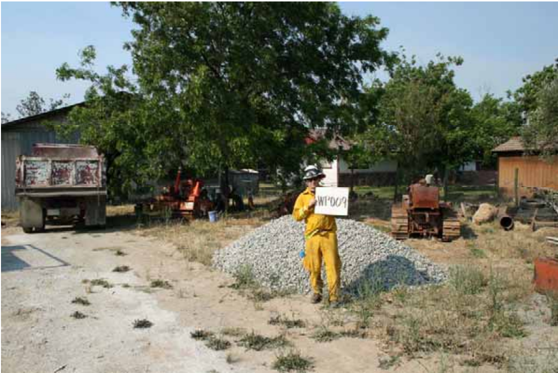
Waypoint 009, 1784 Palermo Rd 6/12/08