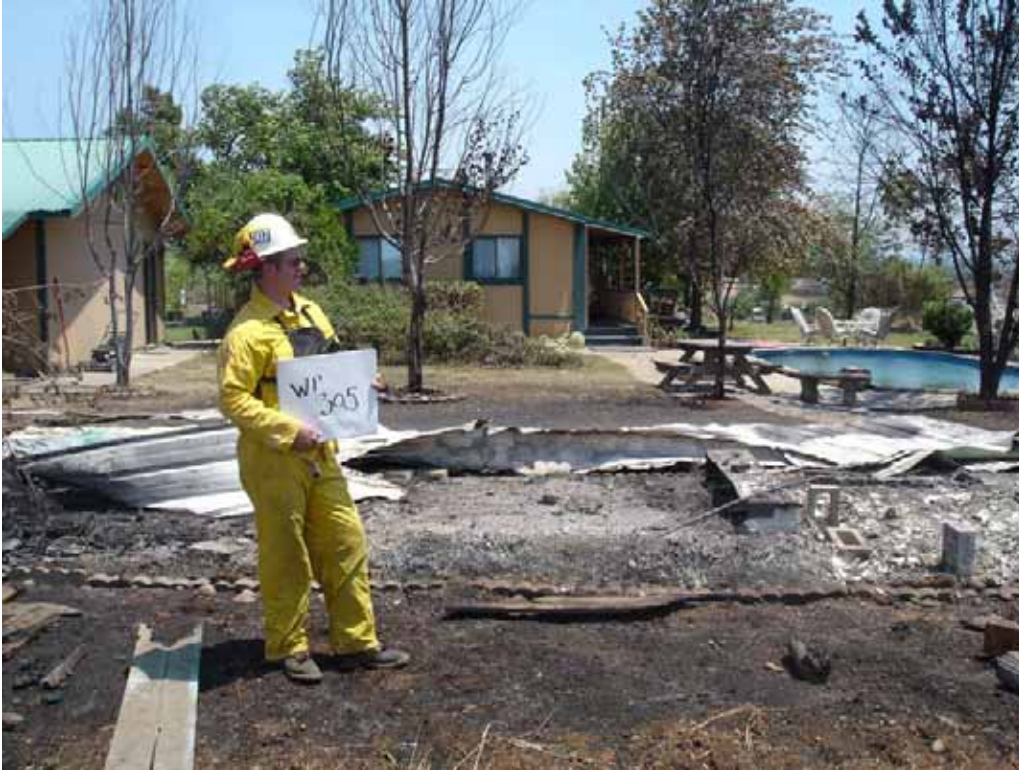
Waypoint 305, 354 Lone Tree Rd 6/12/08