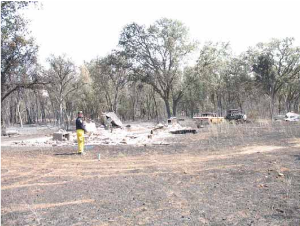
Waypoint 207, 7025 Occidental Ave 6/12/08