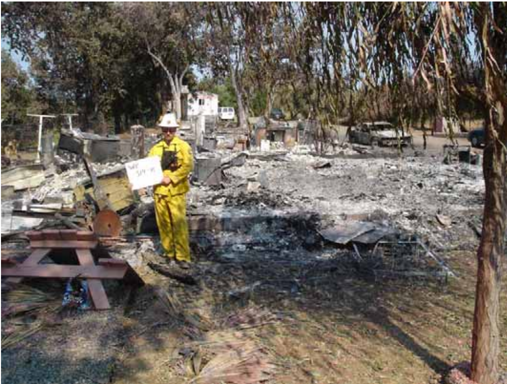
Waypoint 314-B, 2540 Palermo-Honcut Hiway 6/12/08