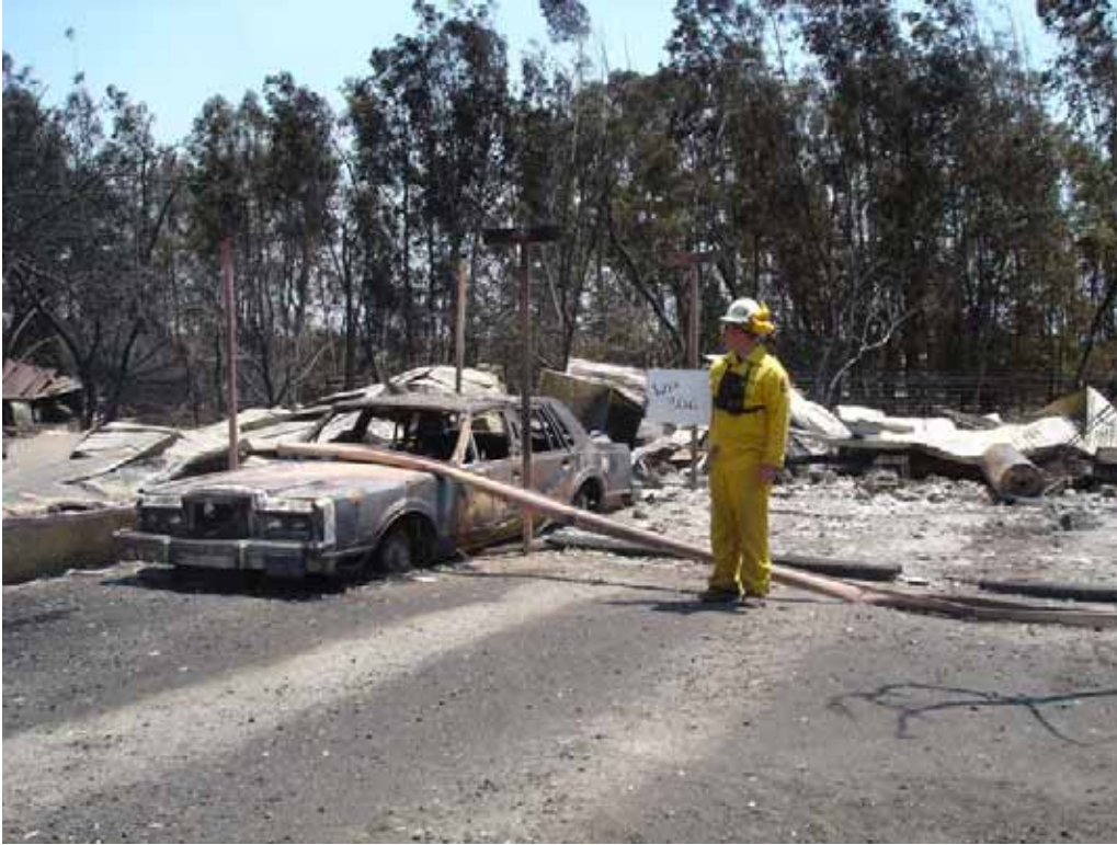
Waypoint 306, 378 Lone Tree Rd 6/12/08