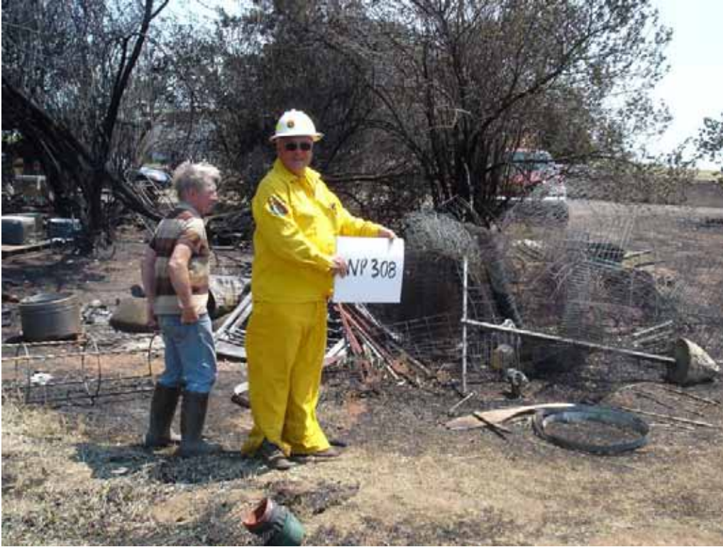
Waypoint 308, 467 Lone Tree Rd 6/12/08