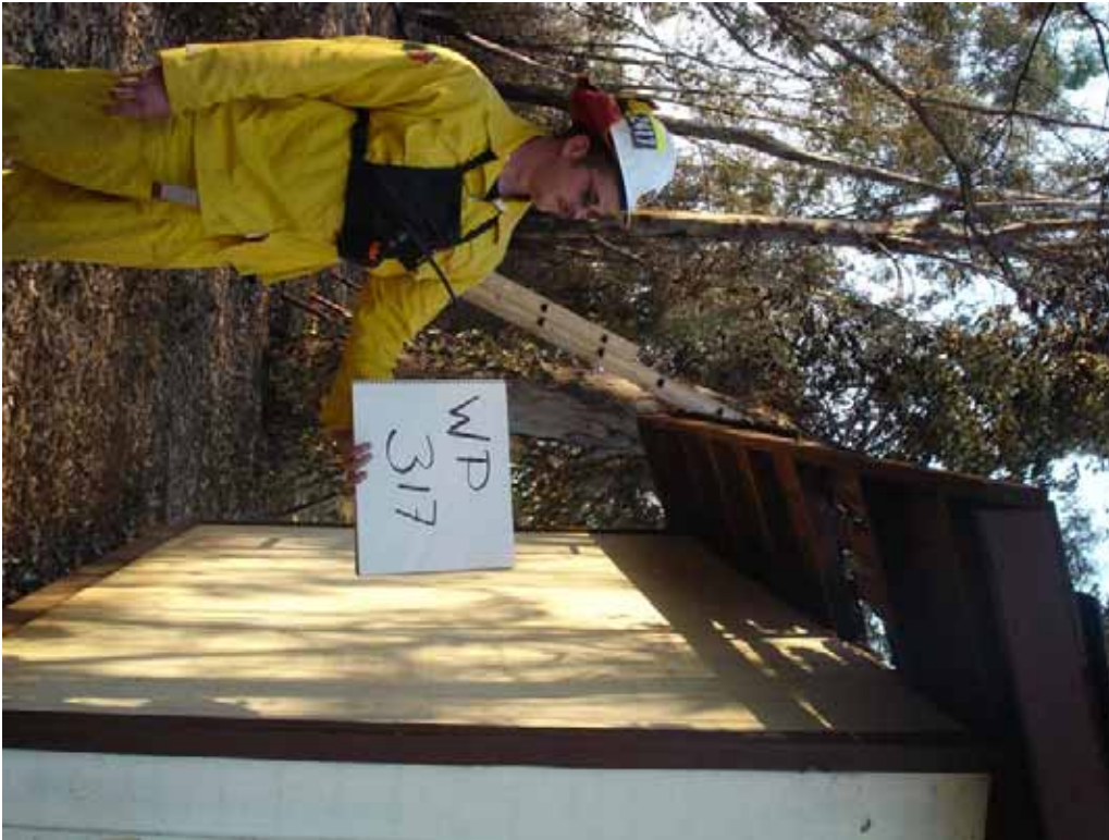
Waypoint 317, 2430 Alice Ave 6/12/08