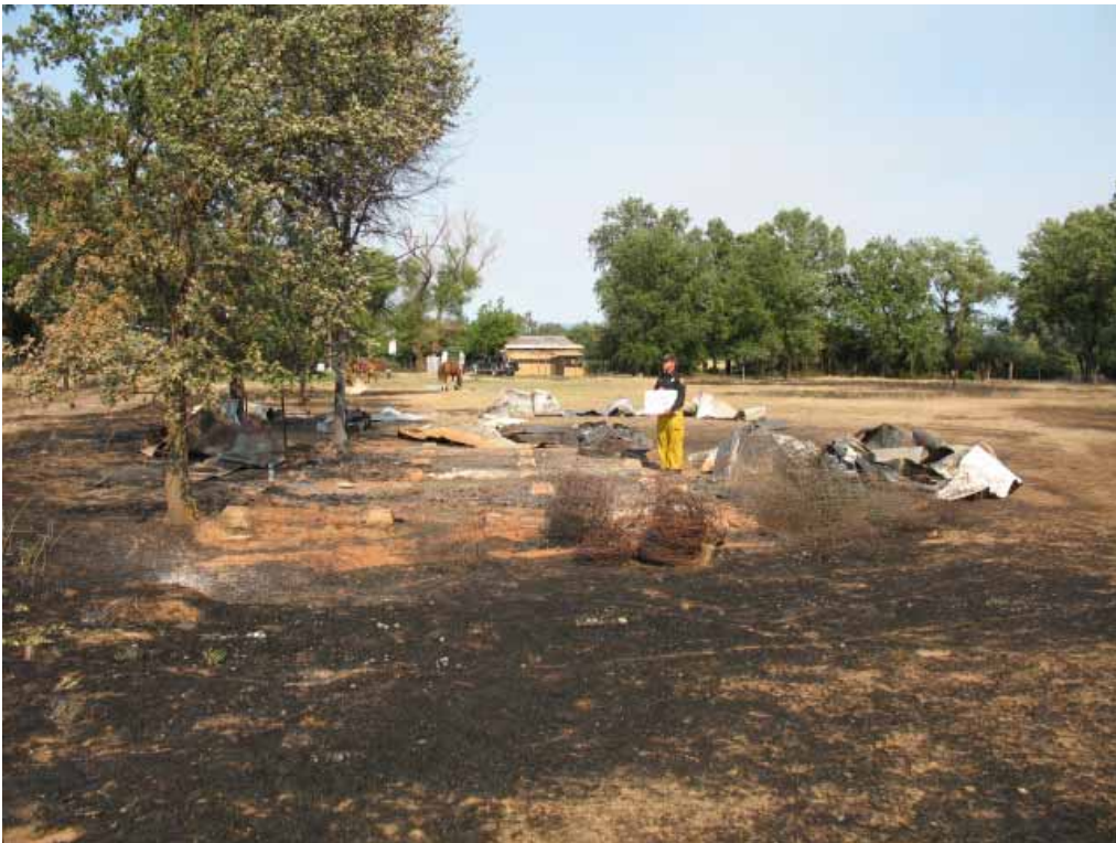
Waypoint 210, 1737 Palermo Rd 6/12/08