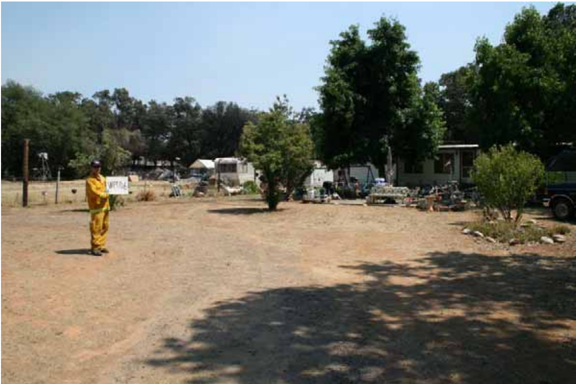
Waypoint 006, Waypoint 006, 2055 Williams Ave 6/12/08