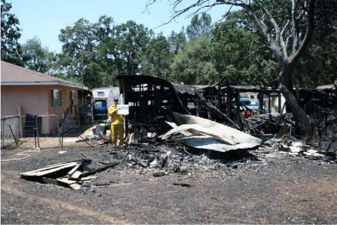
Waypoint 003, 2060 South Villa Ave 6/12/08