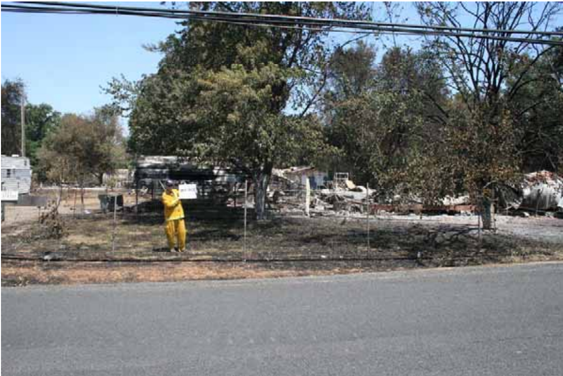
Waypoint 002, 2080 South Villa Ave 6/12/08