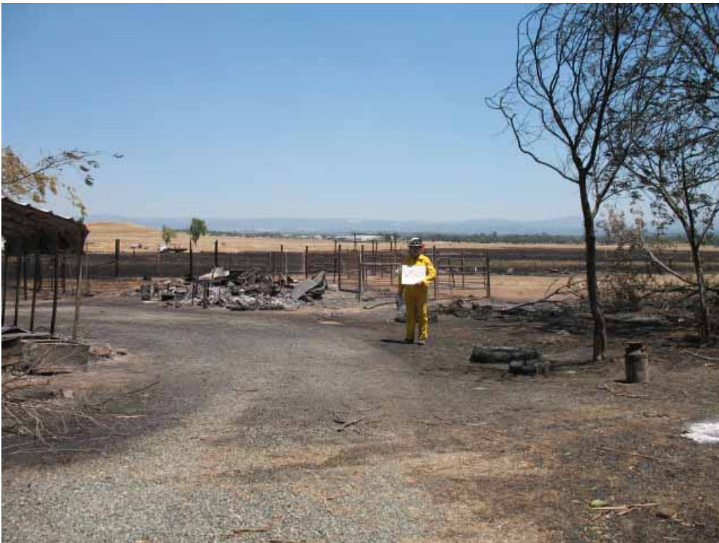
Waypoint 204, 88 Horney Toad Rd 6/12/08