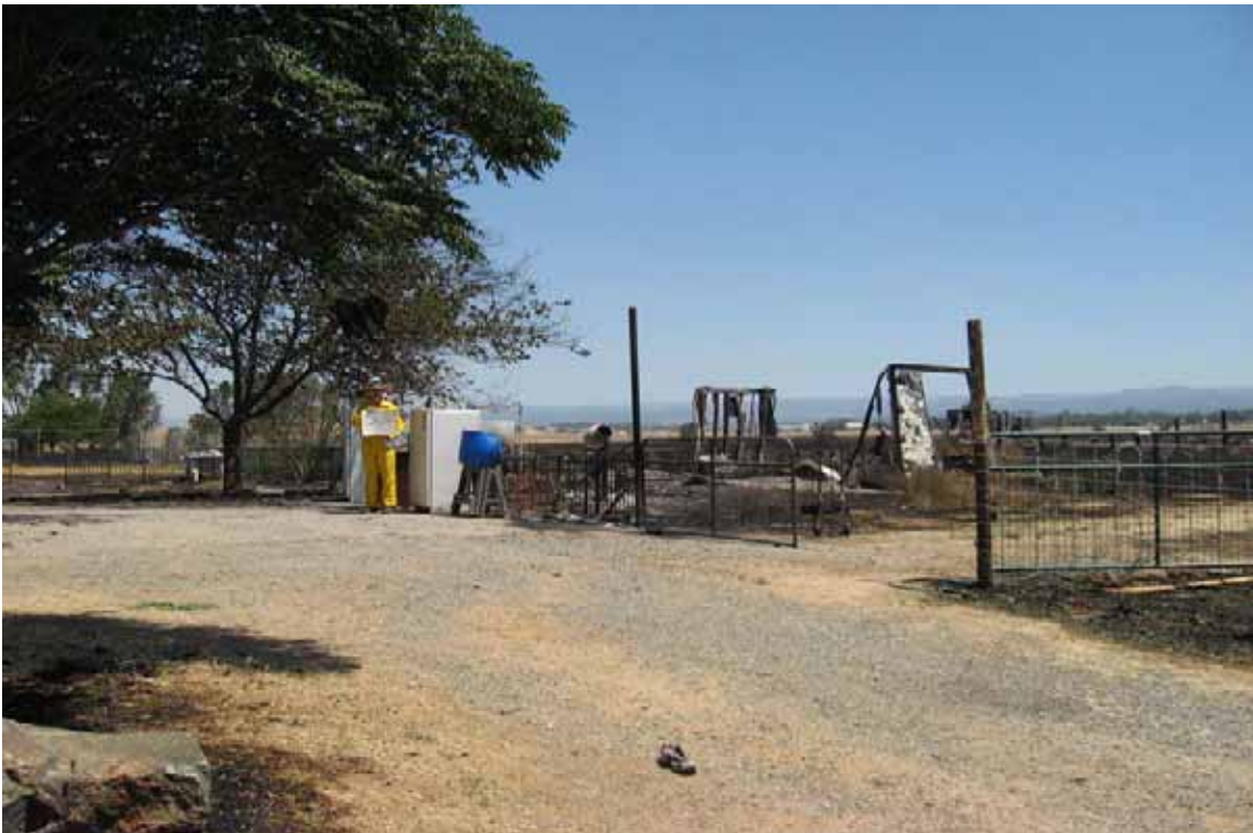
Waypoint 200, 111 Prince Rd 6/12/08