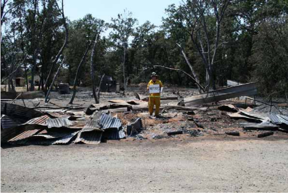
Waypoint 005, 2061 Ludlum Ave 6/12/08