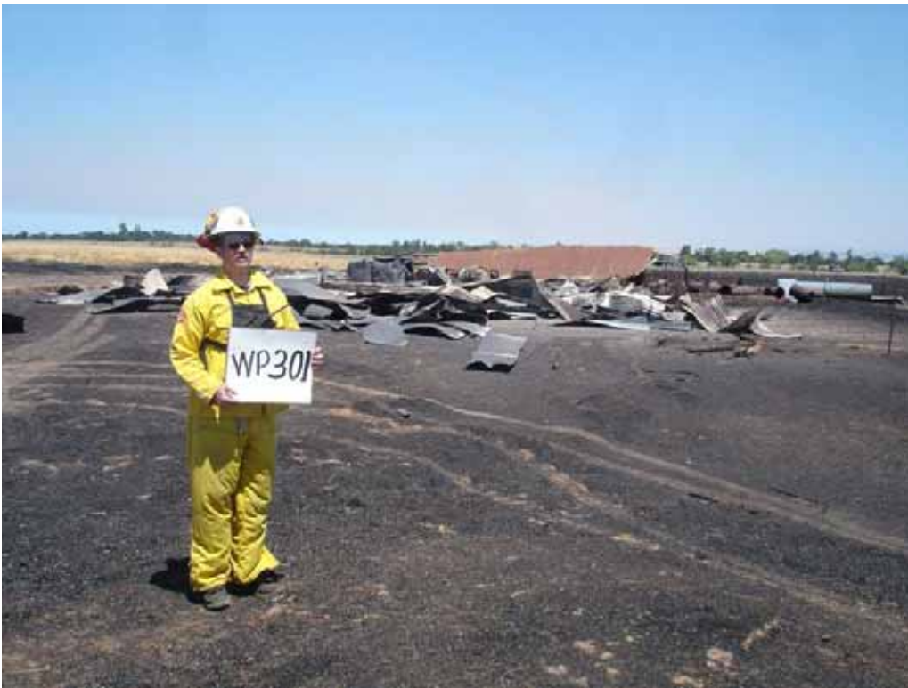
Waypoint 301, 5112 Powerhouse Hill Rd 6/12/08