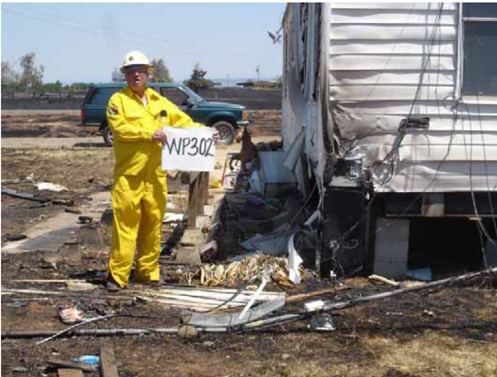
Waypoint 302, 5171 Powerhouse Hill Rd 6/12/08