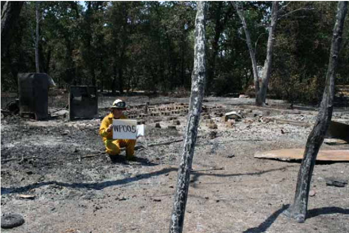
Waypoint 005, 2061 Ludlum Ave 6/12/08