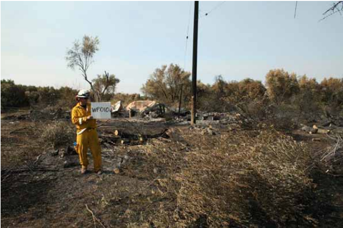
Waypoint 010, 1780 Palermo Rd 6/12/08