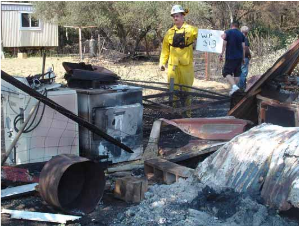
Waypoint 313, 7875 Irwin Ave 6/12/08