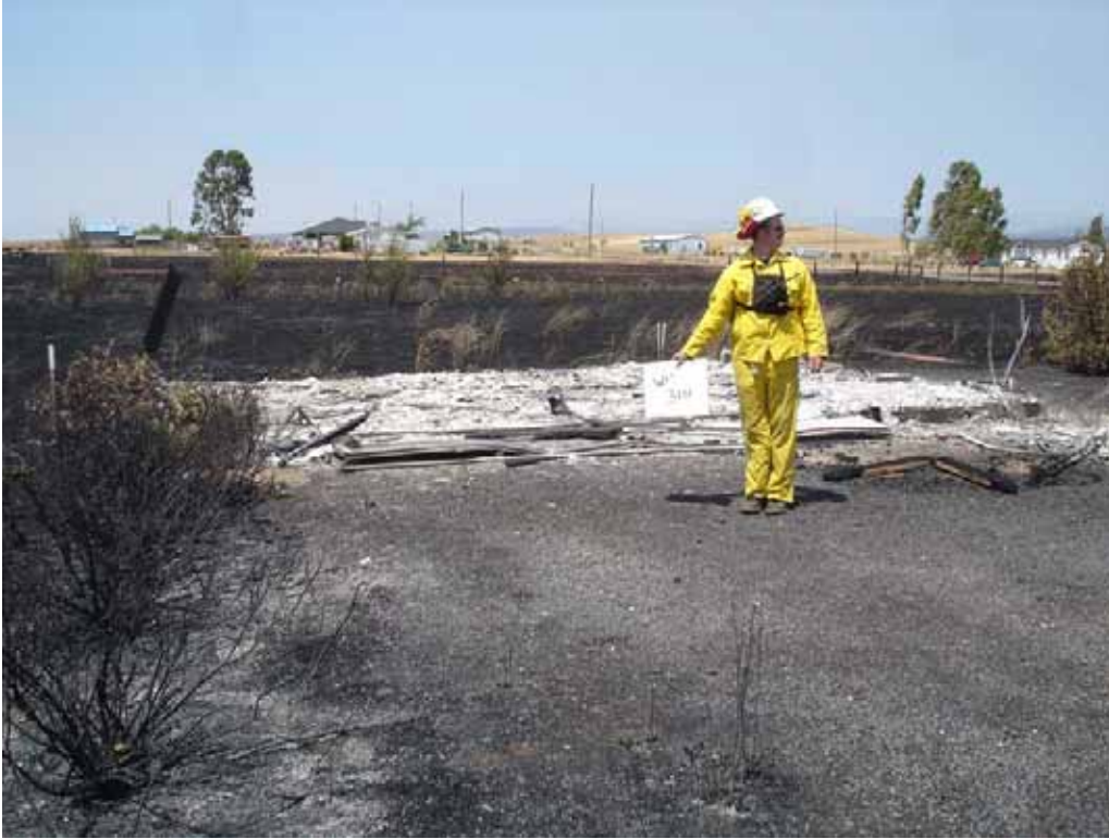
Waypoint 310, 65 Kenneth Ln 6/12/08