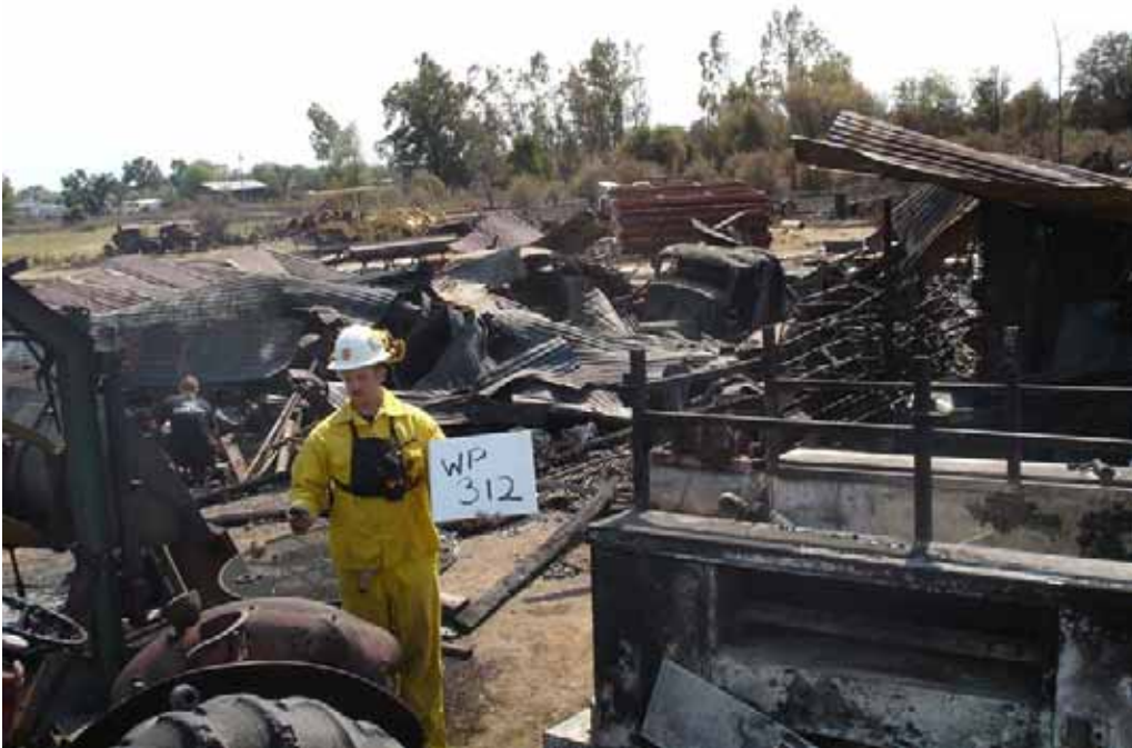
Waypoint 312, 7874 Irwin Ave 6/12/08