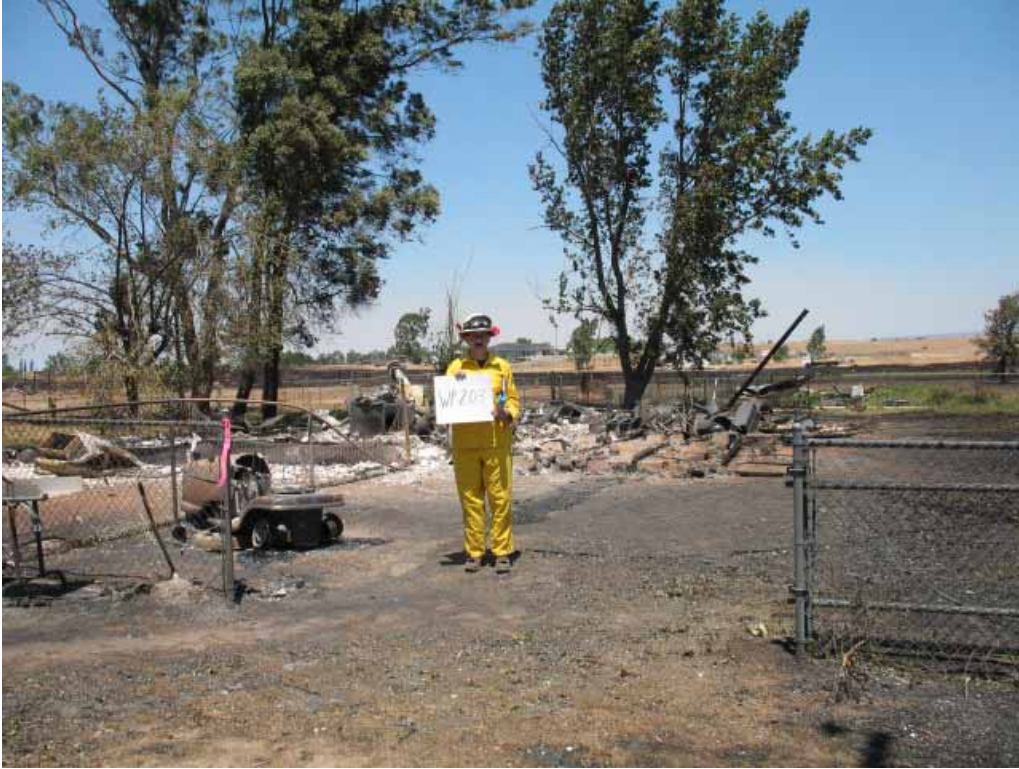
Waypoint 203, 29 Mur-Mel Rd 6/12/08