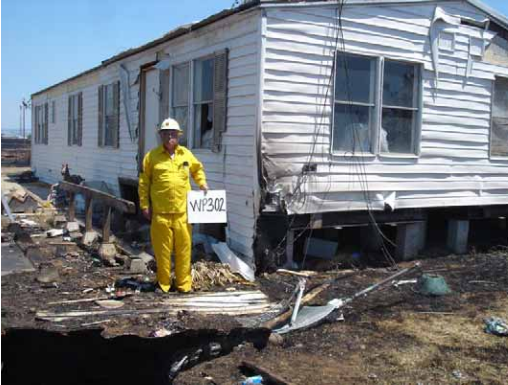
Waypoint 302, 5171 Powerhouse Hill Rd 6/12/08