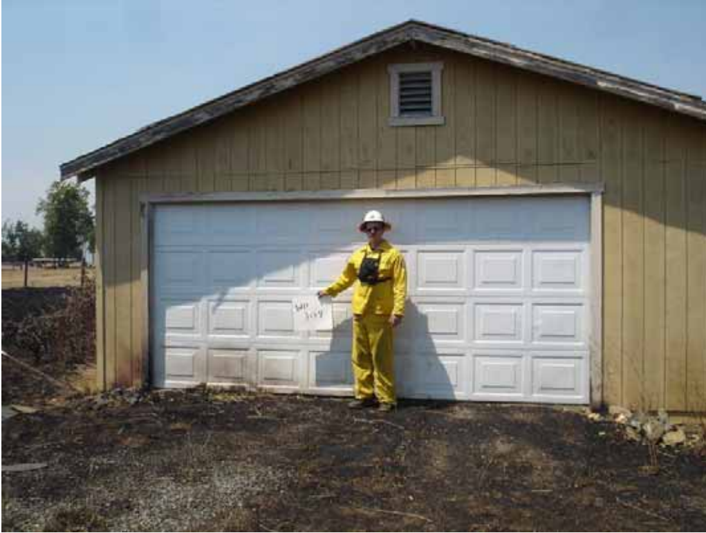
Waypoint 309, 57 Kenneth Ln 6/12/08