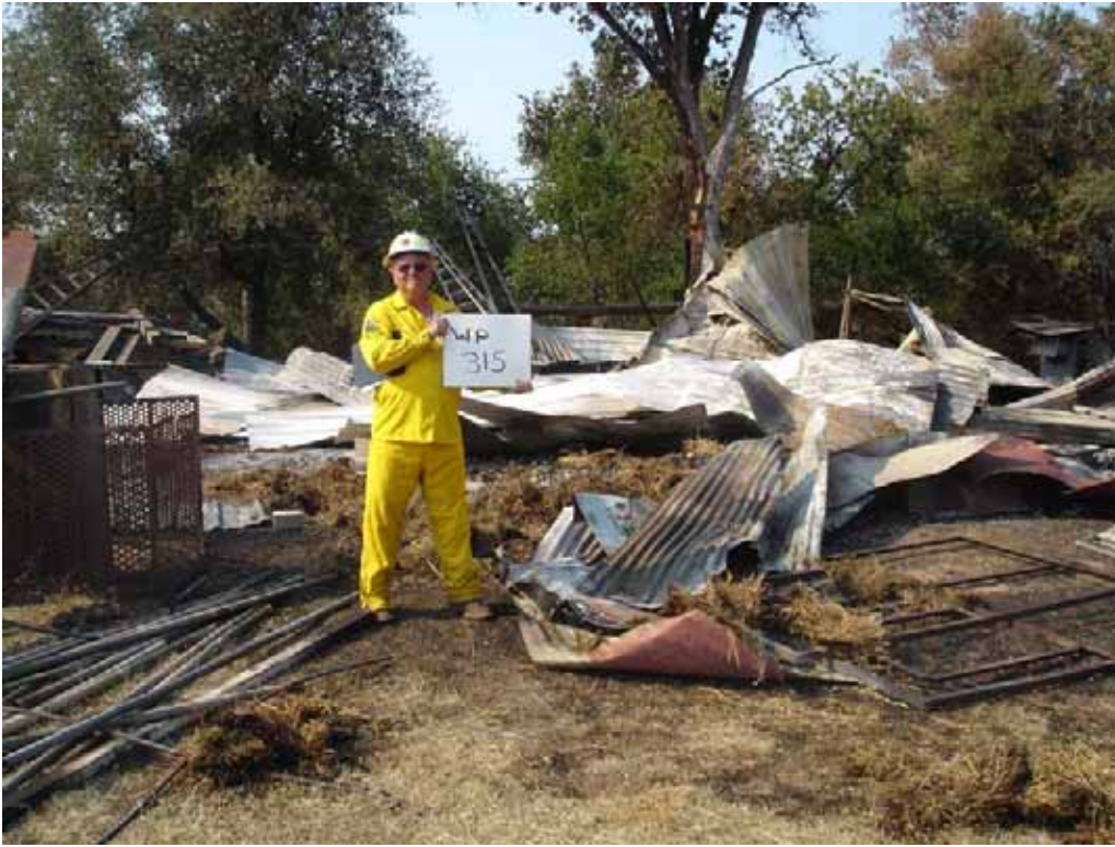
Waypoint 315, 2420 Louis Ave 6/12/08