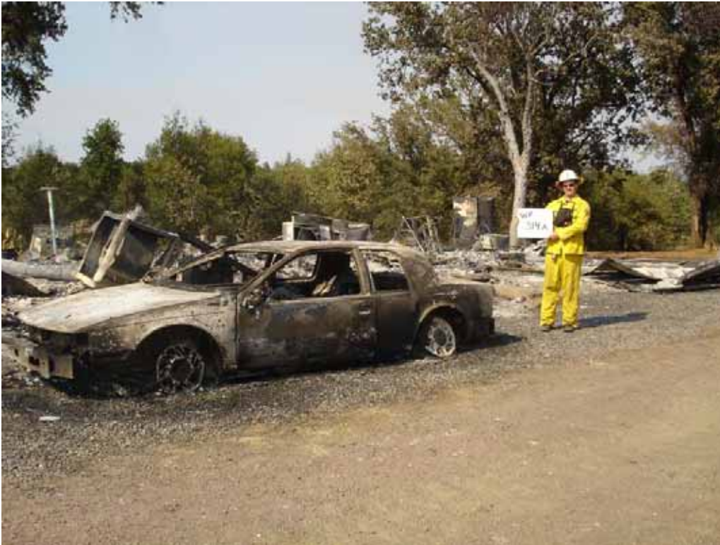
Waypoint 314-A, 2540 Palermo-Honcut Hiway 6/12/08