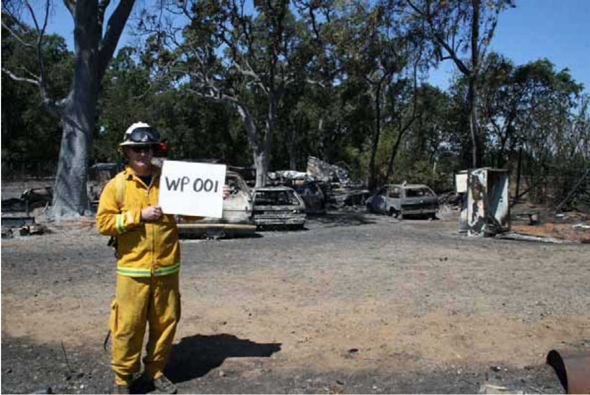
Waypoint 001, 1981 South Villa Ave 6/12/08