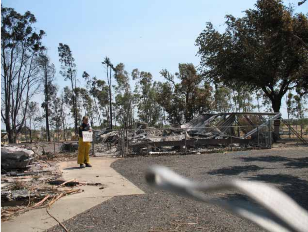
Waypoint 205, Theresa Lane 6/12/08