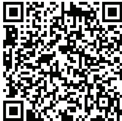
Vet's IR Feed scan with QR reader