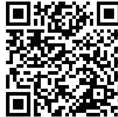
Sherpa Mobile Map scan with Avenza