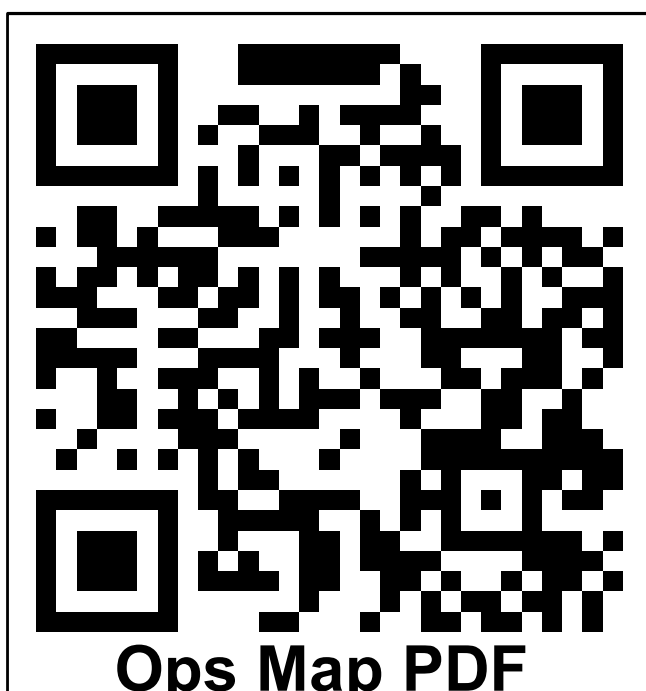
Ops Map PDF