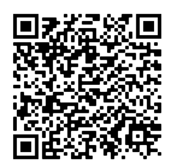
Coleman IAP & Maps Dolan IAP & Maps