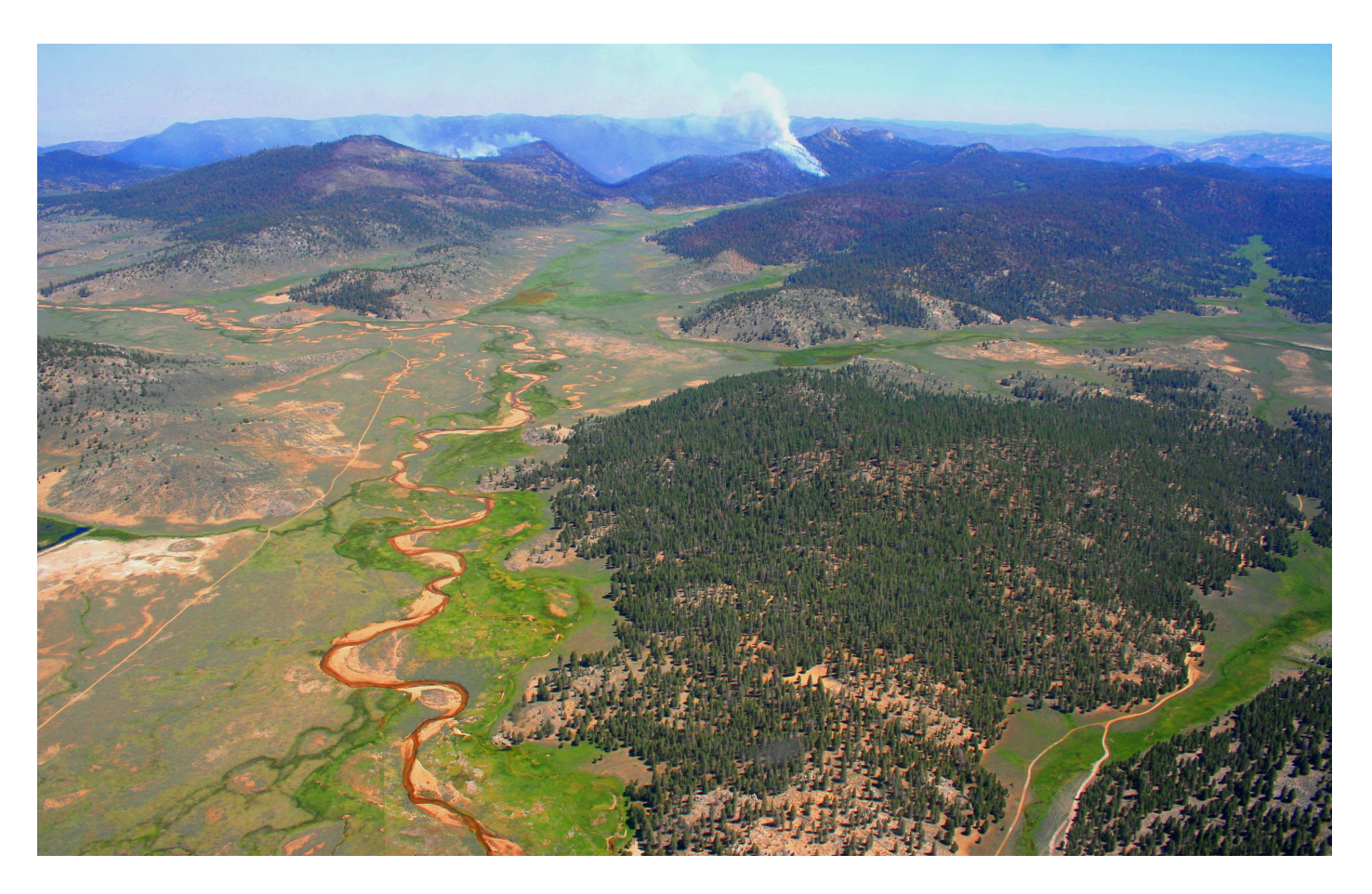
View looking southeast from over Monache Meadows, Inyo National Forest, with the South Fork of the Kern River in foreground.