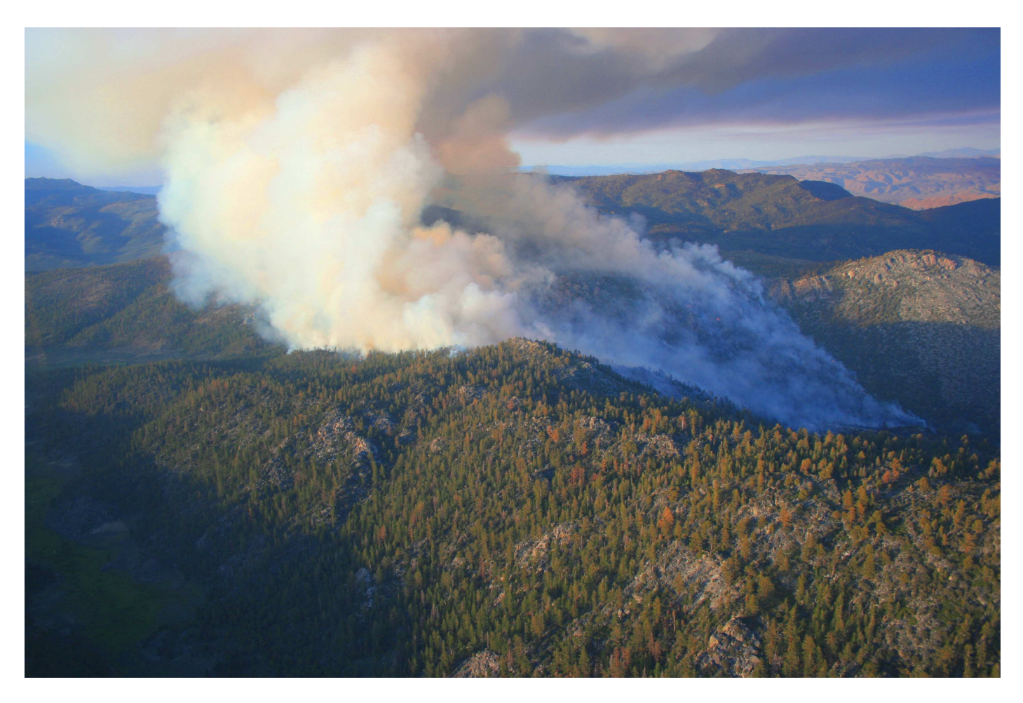
June 8, 2008, 1930 hours, view looking northeast across northern portion of Crag Peak ridge during the fire's run out of Crag Creek towards the north.