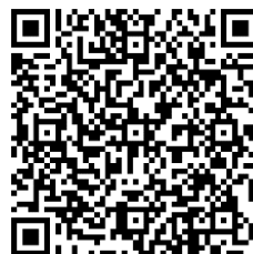
DMOB Flight Request

Please contact the DMOB Unit Leader if you need assistance. 2022.moose.demob@firenet.gov Phone: 970-759-9611