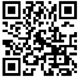
State Repeater Map Nevada Size: 8 ½" x 11" Year: 2020

Below is a map of repeater locations throughout the state of Nevada for the Bureau of Land Management, Humboldt-Toiyabe National Forest, and Nevada Division of Forestry. There are no frequencies on this map.