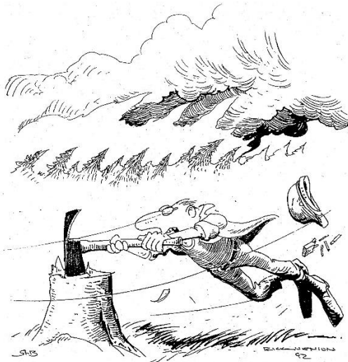
15. WIND INCREASES AND/OR CHANGES DIRECTION