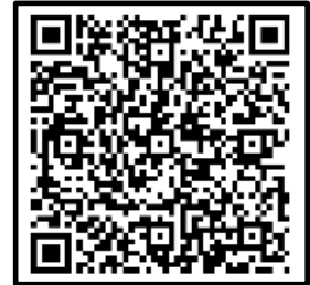
Demob Request Form