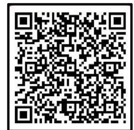
Demob Release Form

DMOB Unit (only valid through 7/26) 2024.horsegulch.demob@firenet.gov