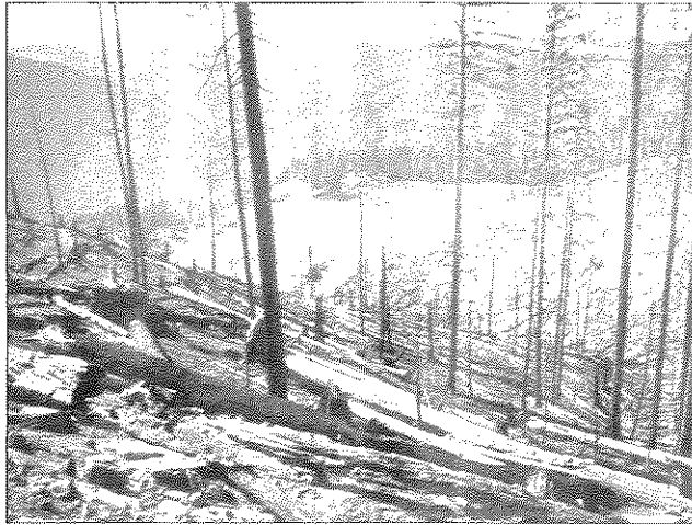
Overlooking a tributary to Little Creek, a drainage within the Lower Meadow Creek subwatershed in the Selway River basin

Road treatments and hillslope treatments could lessen sediment yields to Meadow Creek but are unlikely to largely buffer any other post-fire effect to fisheries or aquatic habitat given the scale of mod-high burn severity on many of the hillslopes along Meadow Creek. Mulching treatments were considered for fisheries habitat protection, but were not deemed cost effective.