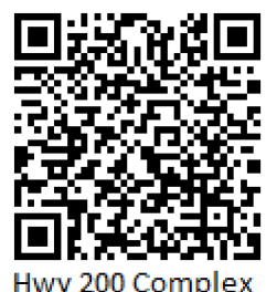
Hwy 200 Complex