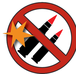
Tracer rounds prohibited