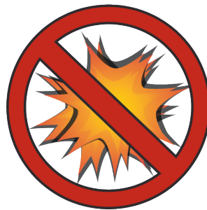
Exploding targets prohibited

Some activities may be prohibited on public lands, including explosives, fireworks, tracer rounds, incendiary ammunition and exploding targets. Know before you go by checking with your land management agency.