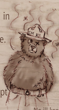
No ill-kept Smokey!