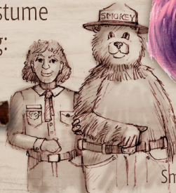
Smokey & escort

Individuals who use the costume must agree to the following: