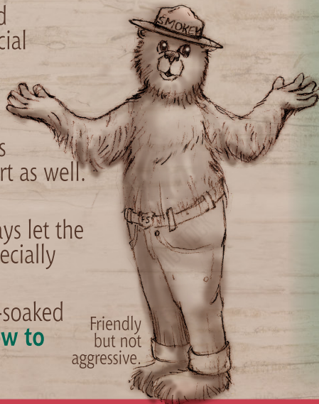
Friendly but not aggressive.

After use do not put a sweat-soaked costume back in the box. Allow to air-dry first.