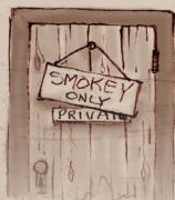
Private dressing area

USE the Smokey Bear costume ONLY to further public information, education, and awareness of wildfire prevention.