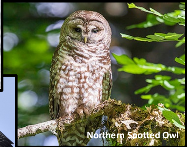
Northern Spotted Owl