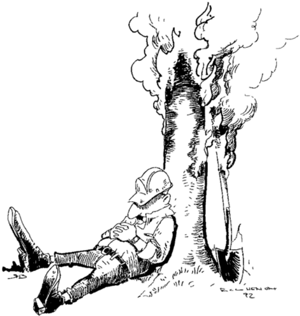
18.TAKING A NAP NEAR THE FIRELINE