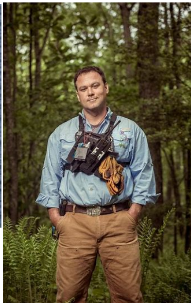
THE ADAM WARWICK