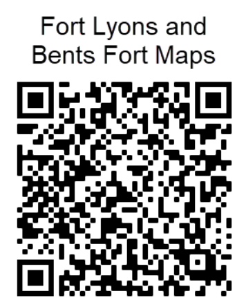
Fort Lyons and Bents Fort Maps