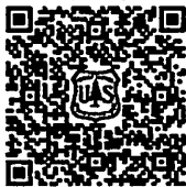
Trail Springs Fire

InciWeb: https://inciweb.nwcg.gov/incident-information/cosjf-trail-springs-fire