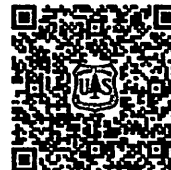
Mill Creek 2 Fire

InciWeb: https://inciweb.nwcg.gov/incident-information/cosjf-mill-creek-2-fire