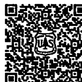
Mill Creek 2 Fire

InciWeb: https://inciweb.nwcg.gov/incident-information/cosif-mill-creek-2-fire