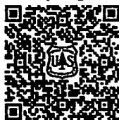
Trail Springs Fire

InciWeb: https://inciweb.nwcg.gov/incident-information/cosjf-trail-springs-fire