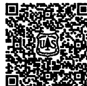
Mill Creek 2 Fire

InciWeb: https://inciweb.nwcg.gov/incident-information/cosjf-mill-creek-2-fire