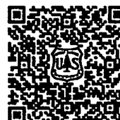
Mill Creek 2 Fire

InciWeb: https://inciweb.nwcg.gov/incident-information/cosjf-mill-creek-2-fire