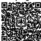
Trail Springs Fire

InciWeb: https://inciweb.nwcg.gov/incident-information/cosjf-trail-springs-fire