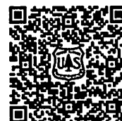
Mill Creek 2 Fire

InciWeb: https://inciweb.nwcg.gov/incident-information/cosjf-mill-creek-2-fire