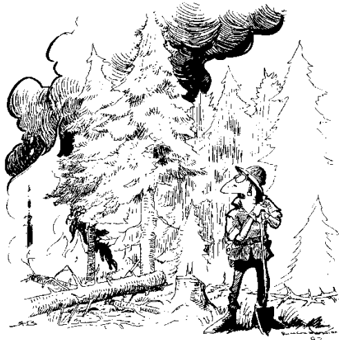
11.UNBURNED FUEL BETWEEN YOU AND THE FIRE

Driving – This is the number one activity that exposes us to risk on a daily basis. Even if we are only driving from our lodging and daily worksite. Minimize distractions, drive defensively, slow down, use spotters, use lights and seatbelts when the vehicle is moving, and expect the unexpected to happen.