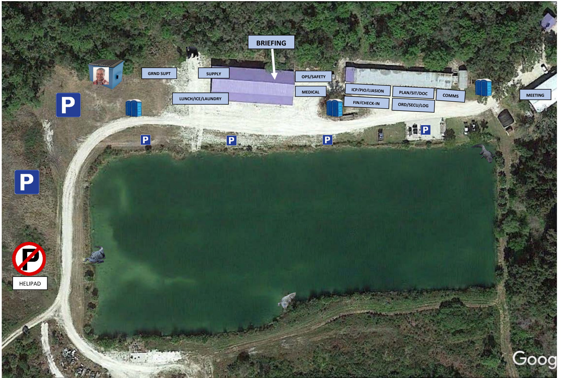
COWBELL FIRE ICP