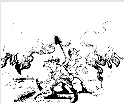
8. CONSTRUCTING FIRELINE WITHOUT SAFE ANCHOR POINT

Fire Order of the Day: Base actions on current and expected behavior of the fire behavior.