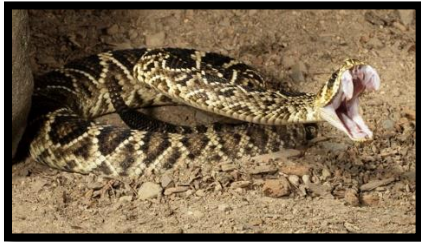
Eastern Diamondback Rattlesnake

As it starts getting hotter in Georgia, snakes will be a little more active in search for shade. The chances of you spotting a snake can be reduced due to camouflage provided by nearby bushes, leaves or other shrubbery.