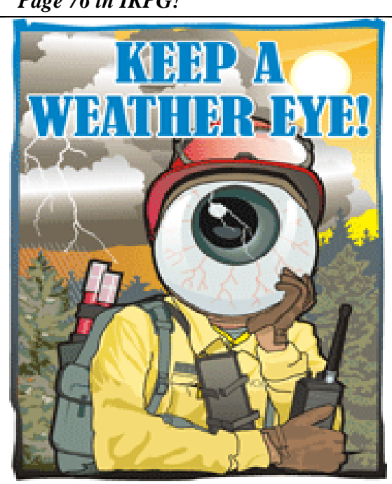
Get Briefings and Monitor the Weather Throughout the Shift!