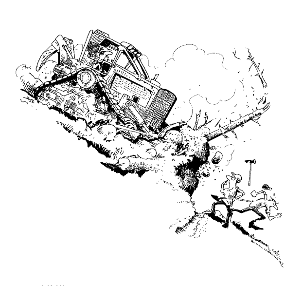
5. UNINFORMED ON STRATEGY, TACTICS AND HAZARDS