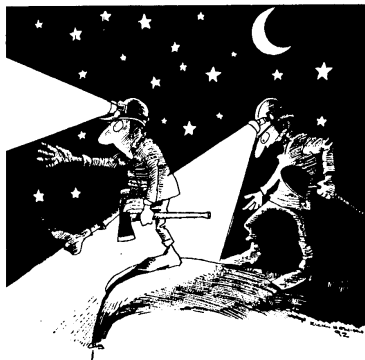
2. IN COUNTRY NOT SEEN IN DAYLIGHT