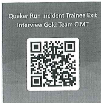
Quaker Run Trainee Exit/Demob

Demob – In order to receive credit for your assignment, you must close out with the Incident Training Specialist prior to departure. Please scan the QR code or use the link below to initiate the check-out/Demob process with the Incident Training Specialist. Please complete the form in its entirety.