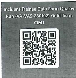
Quaker Run Check-In