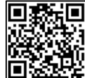
Evacuation Web Map